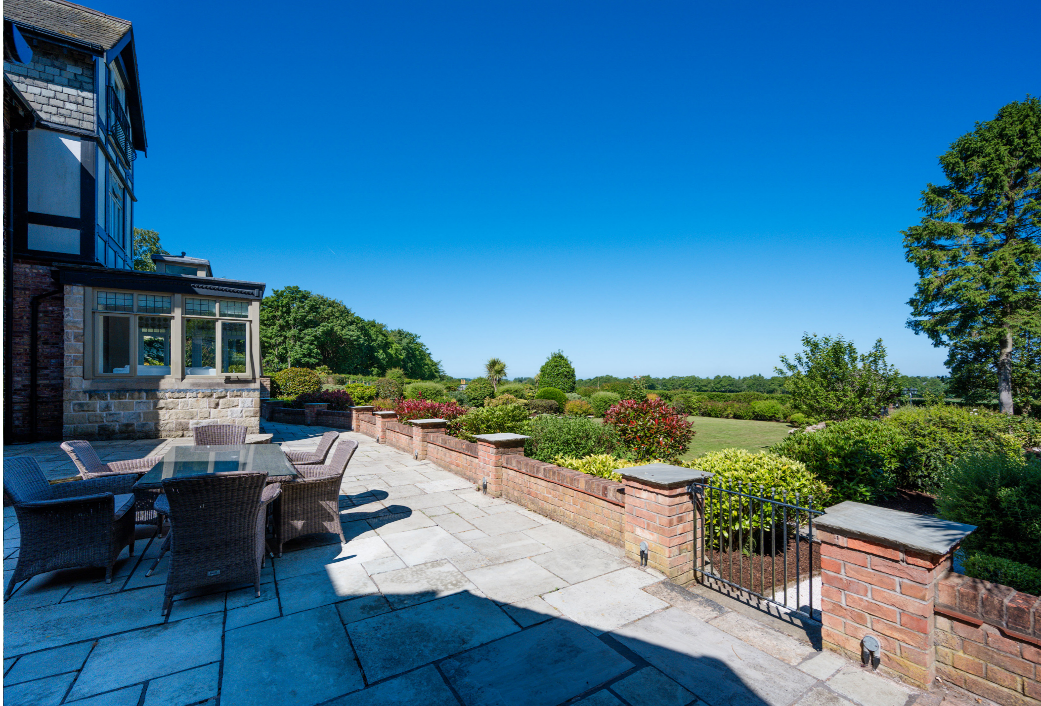
The Dawn, Dark Lane