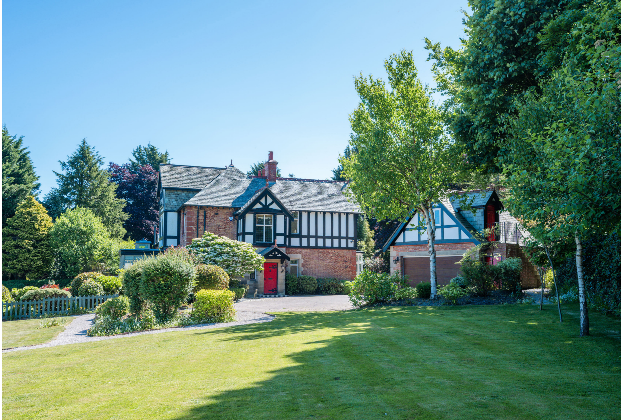
The Dawn, Dark Lane