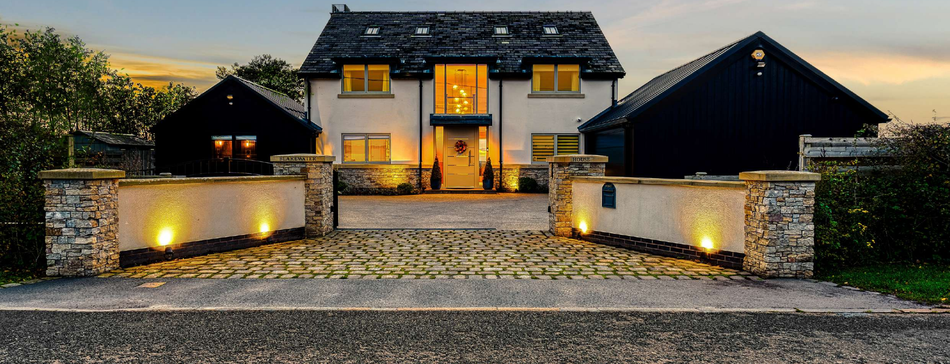
Blakewater House, Fir Tree Lane, Aughton