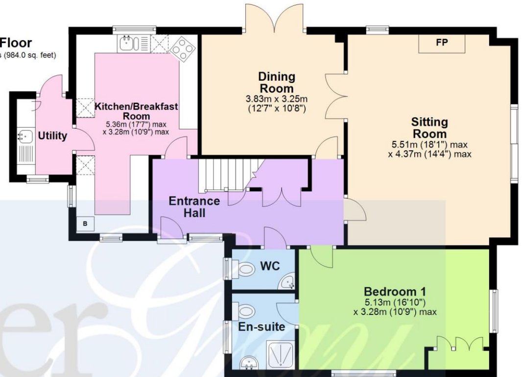
Ground Floor Approx. 91.4 sq. metres (984.0 sq. feet)