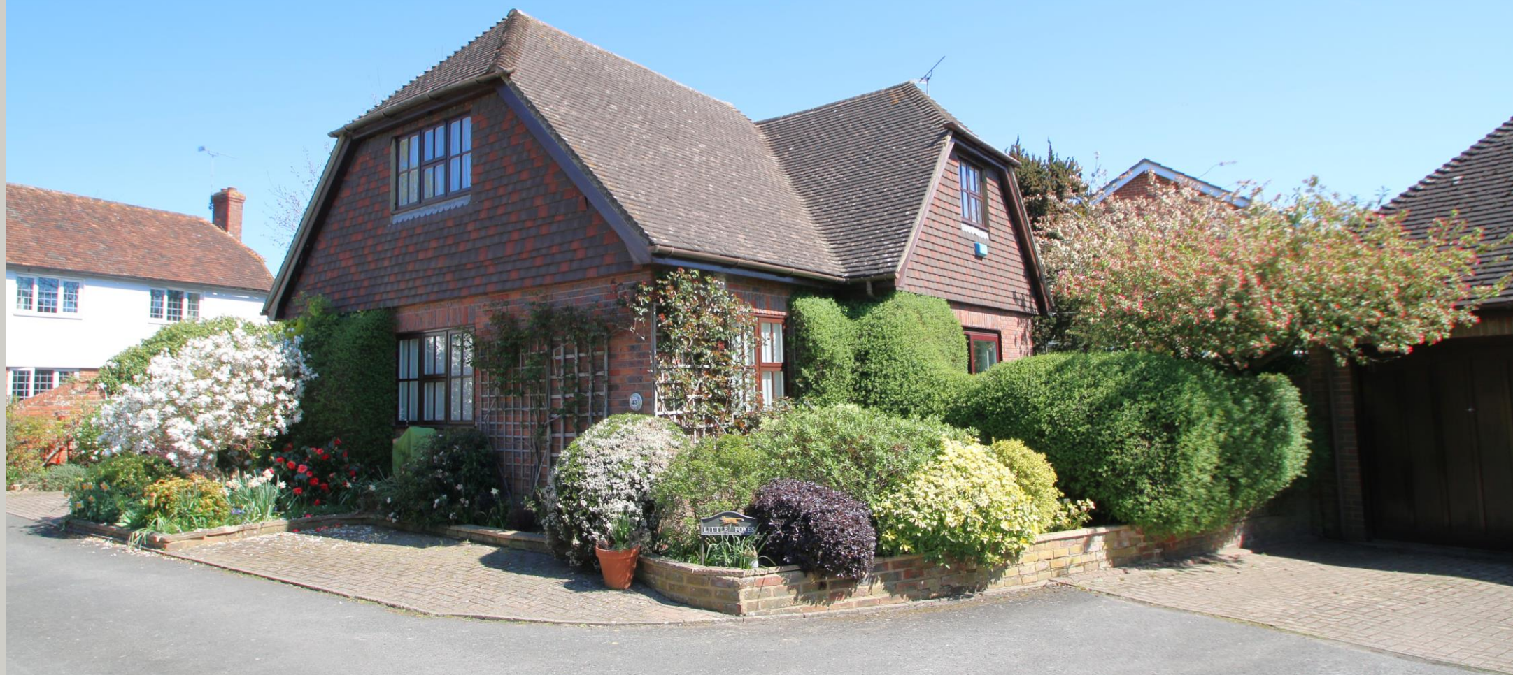
Little Foxes 43 Appledore Road, Tenterden, Kent TN30 7AY