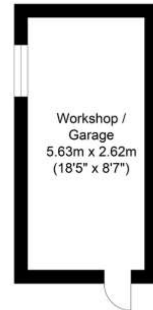
Outbuilding Approximate Floor Area 158.76 sq ft (14.75 sq m)

Approximate Gross Internal Area (Excluding Outbuilding) = 89.40 sq m / 962.29 sq ft Illustration for identification purposes only, measurements are approximate, not to scale.