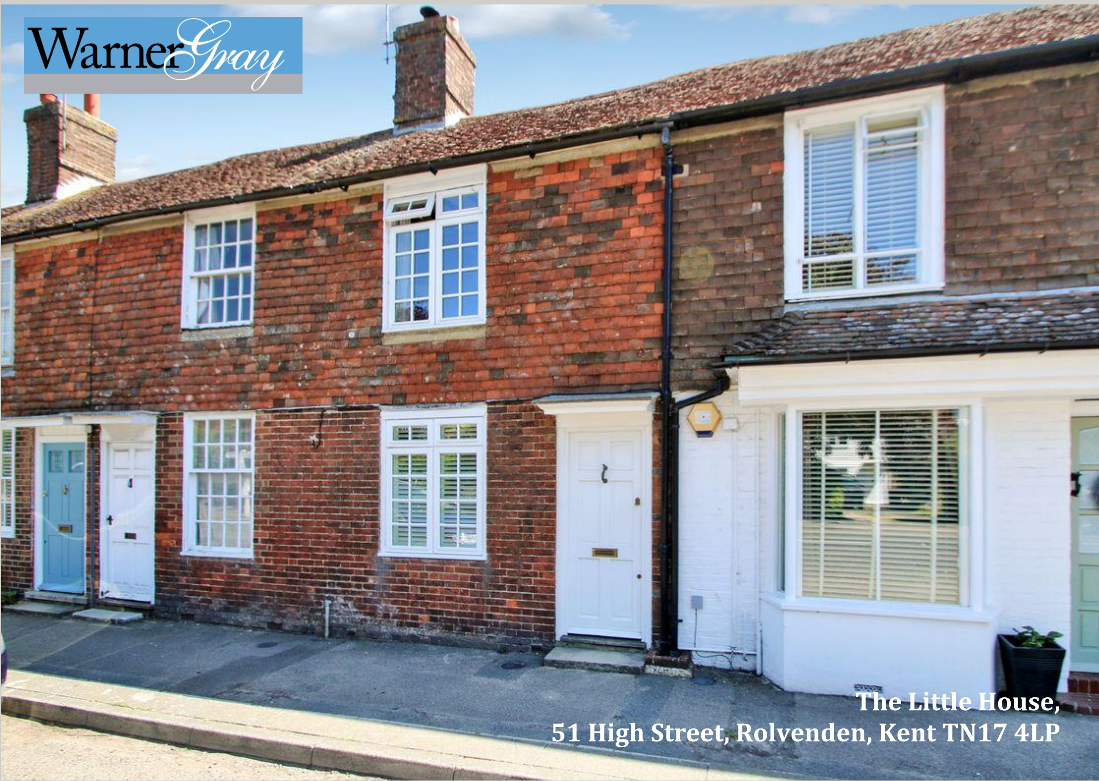
The Little House, 51 High Street, Rolvenden, Kent TN17 4LP