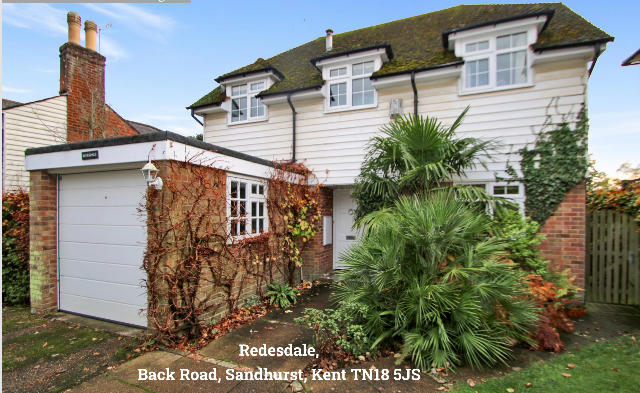
Redesdale, Back Road, Sandhurst, Kent TN18 5JS