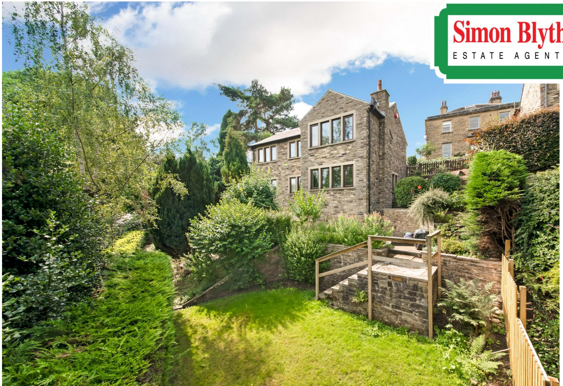
LIVINGSTONE HOUSE, BROADBENT CROFT, OFF SOUTHGATE, HONLEY, HOLMFIRTH