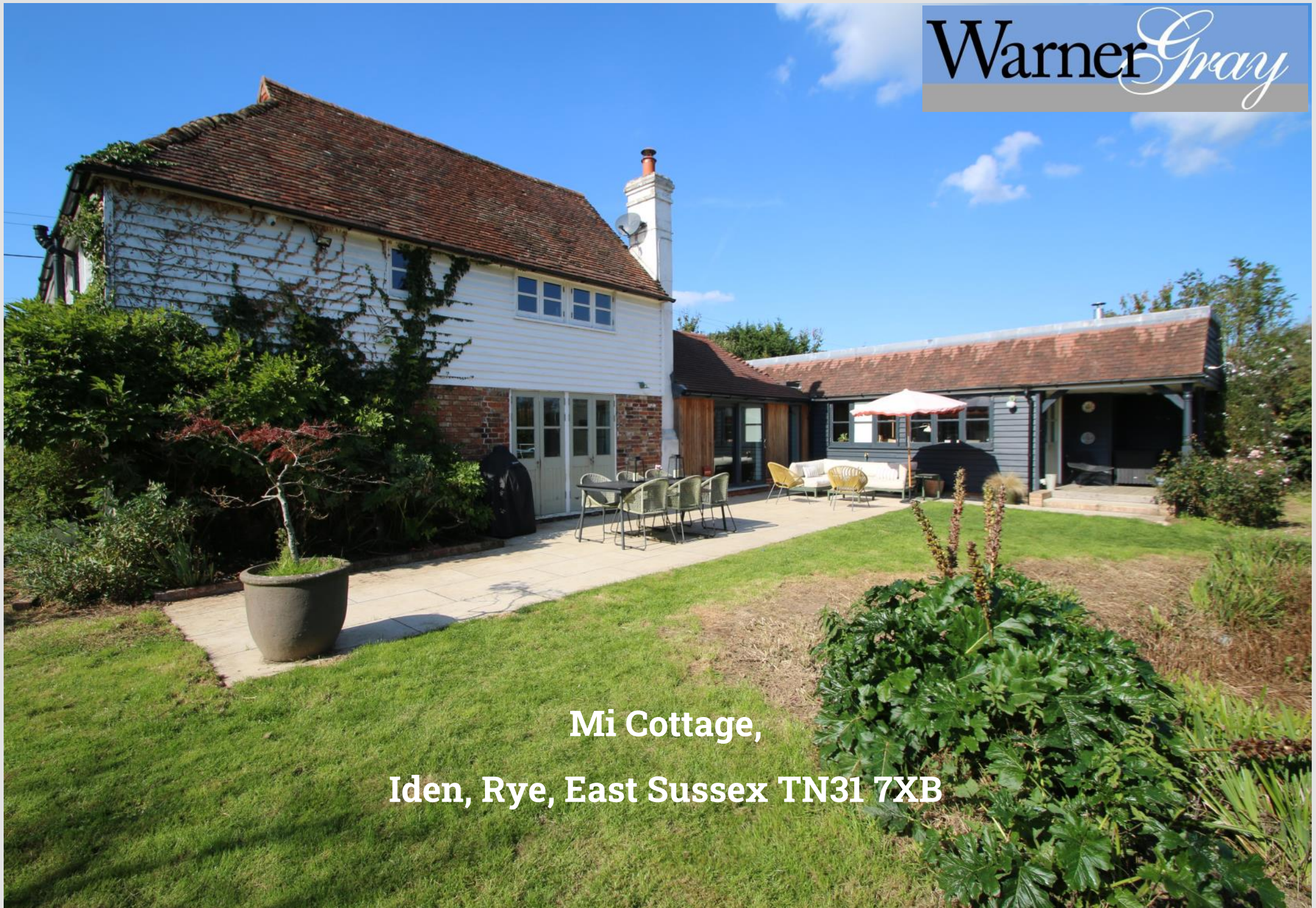
Mi Cottage, Iden, Rye, East Sussex TN31 7XB