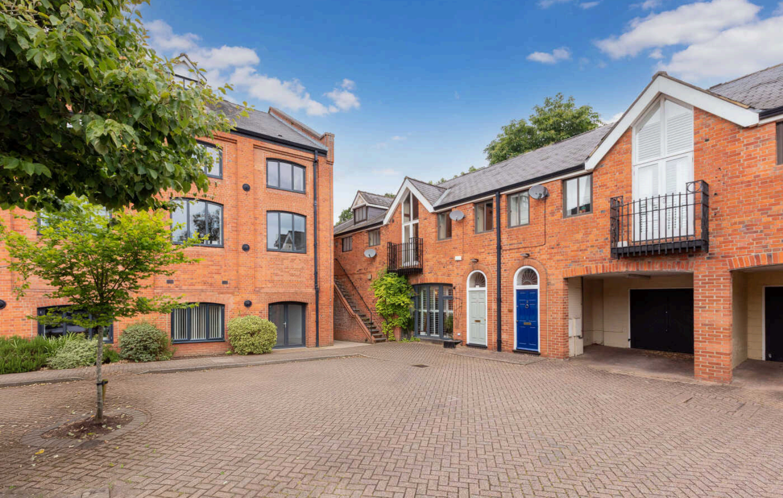
1A BRAKSPEAR MEWS, NEW STREET, HENLEY-ON-THAMES