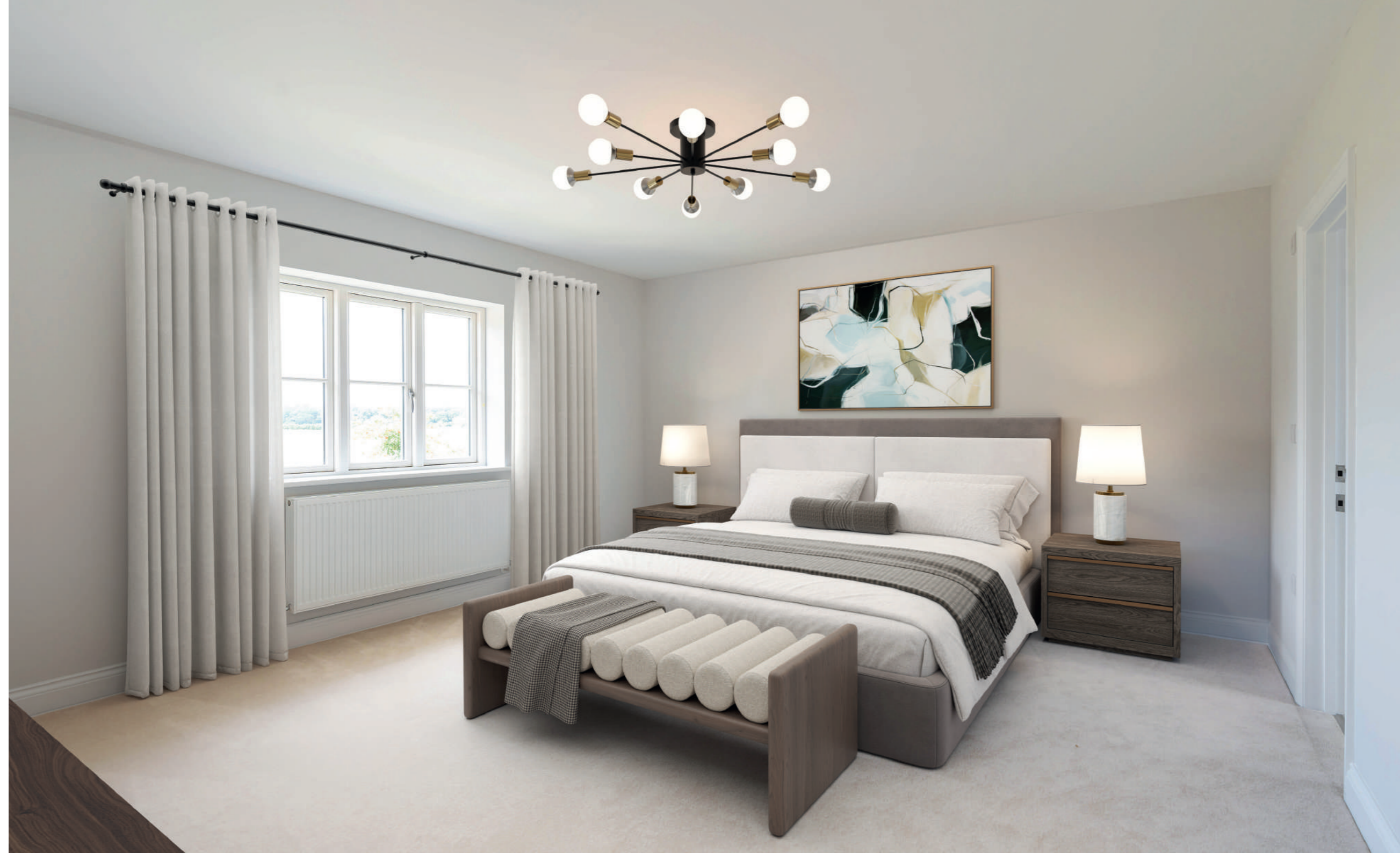
INTERNAL STAGED IMAGES FROM LEFT: Bedroom 1, En-suite