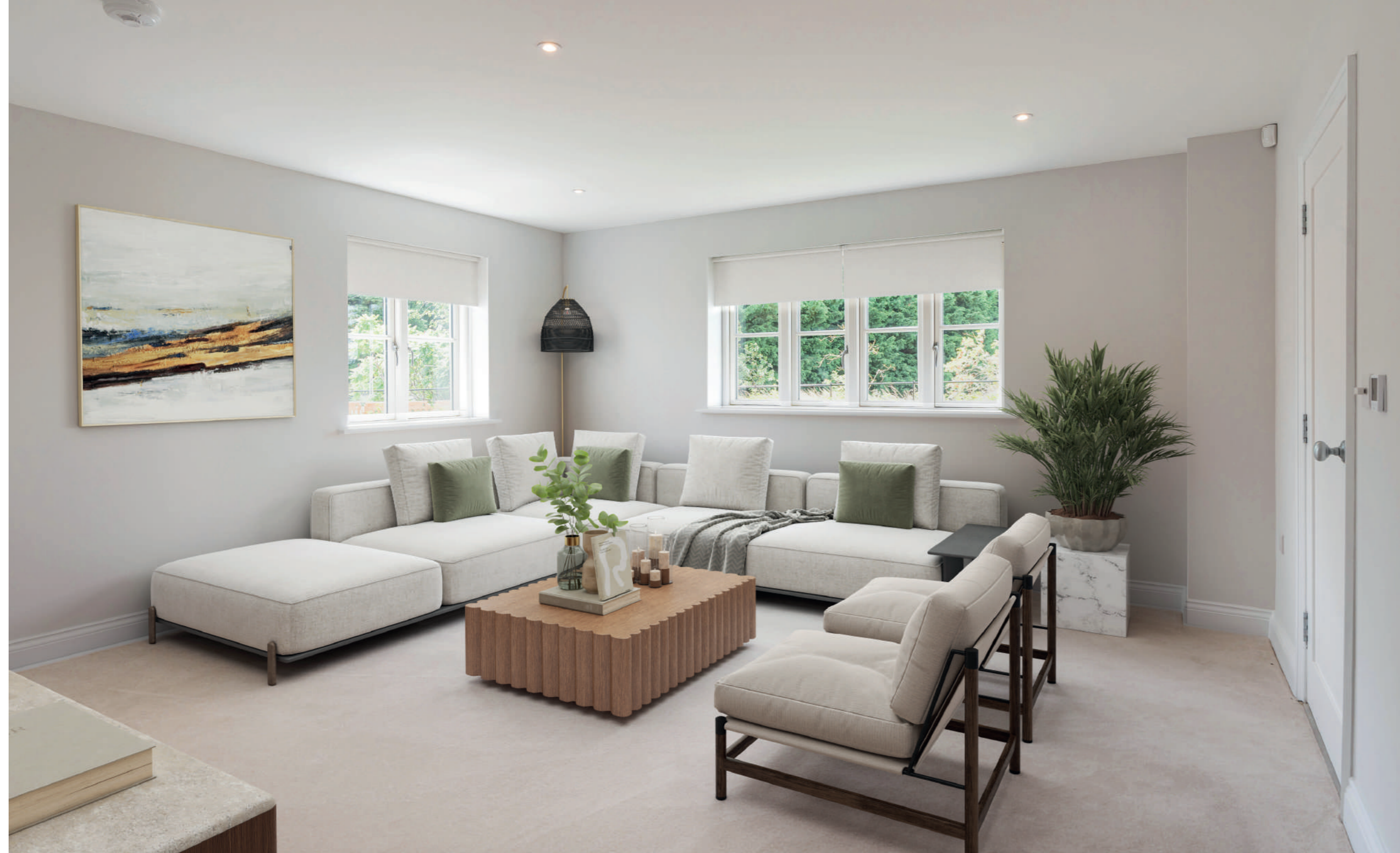
INTERNAL STAGED IMAGES FROM LEFT: Living Room, Kitchen/Dining Room