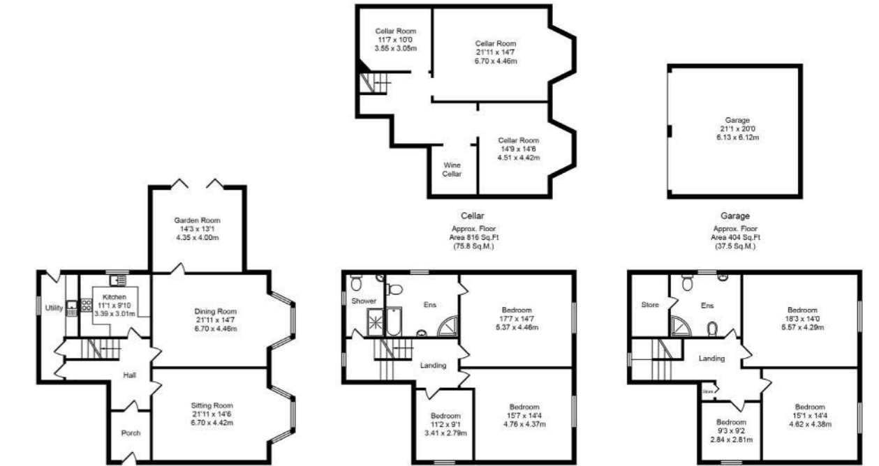
Winifred Lane Total Approx. Floor Area 4216 Sq.ft. (391.7 Sq.M.) Whilst every effort is made to accurately reproduce these floor plans, measurements are approximate, not to scale and for illustrative purposes only.