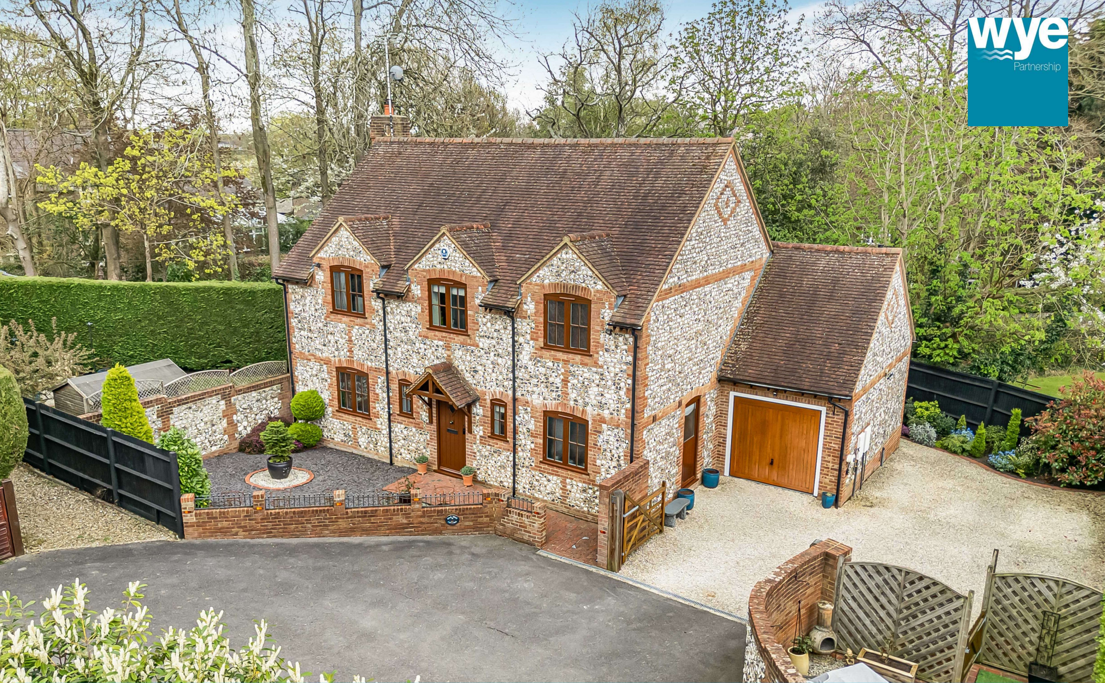
Oak Tree Cottage, 5 Overdales, Hazlemere, Buckinghamshire, HP15 7QD - £995,000