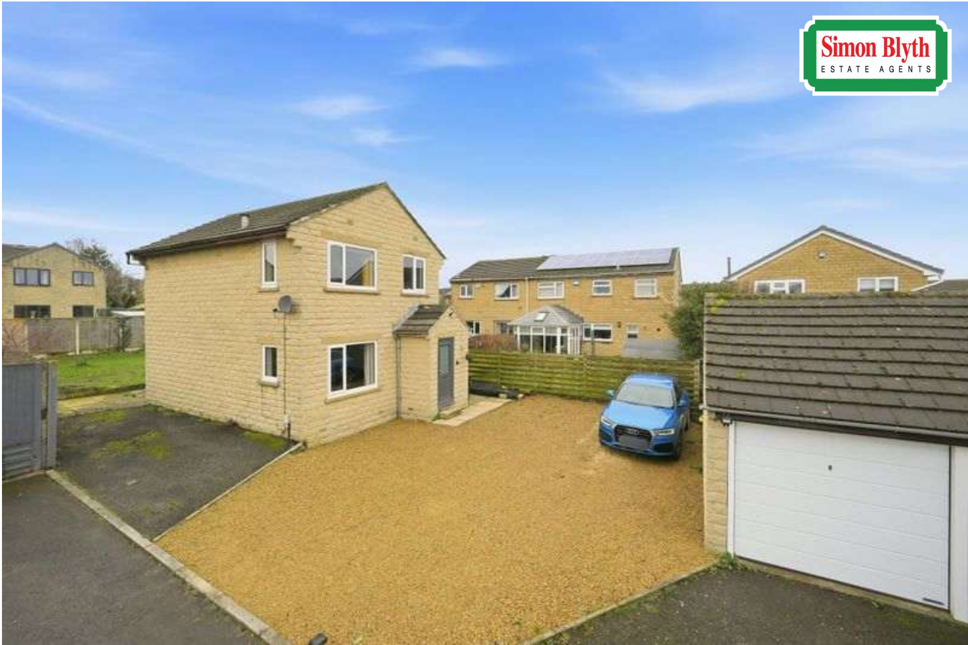
22 Goldcrest Court, Netherton, Huddersfield, HD4 7LN