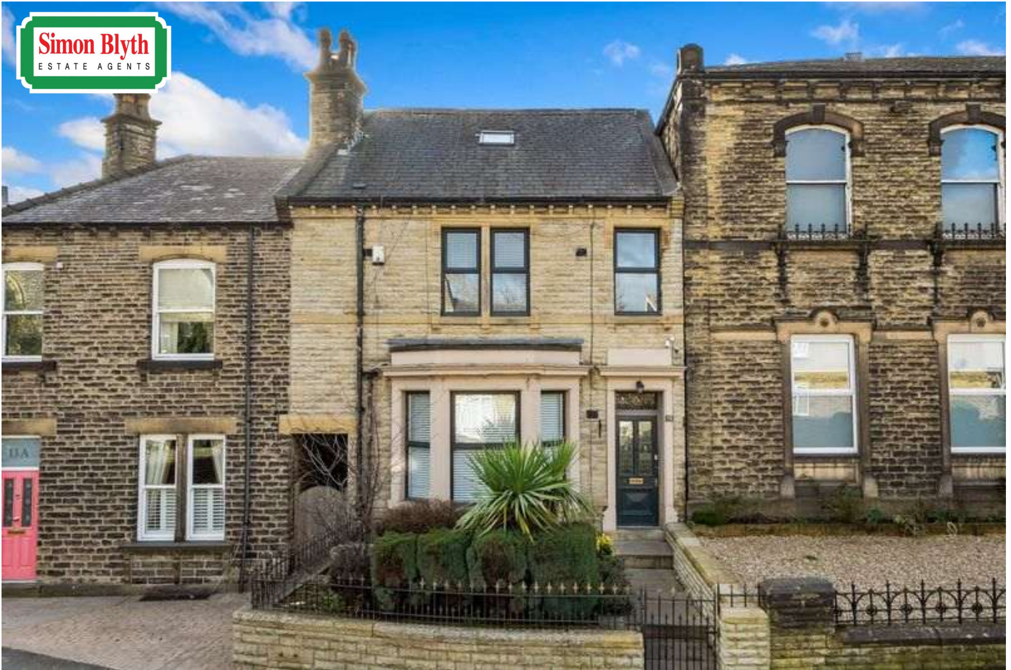
15 Knowl Road, Mirfield, WF14 8DQ