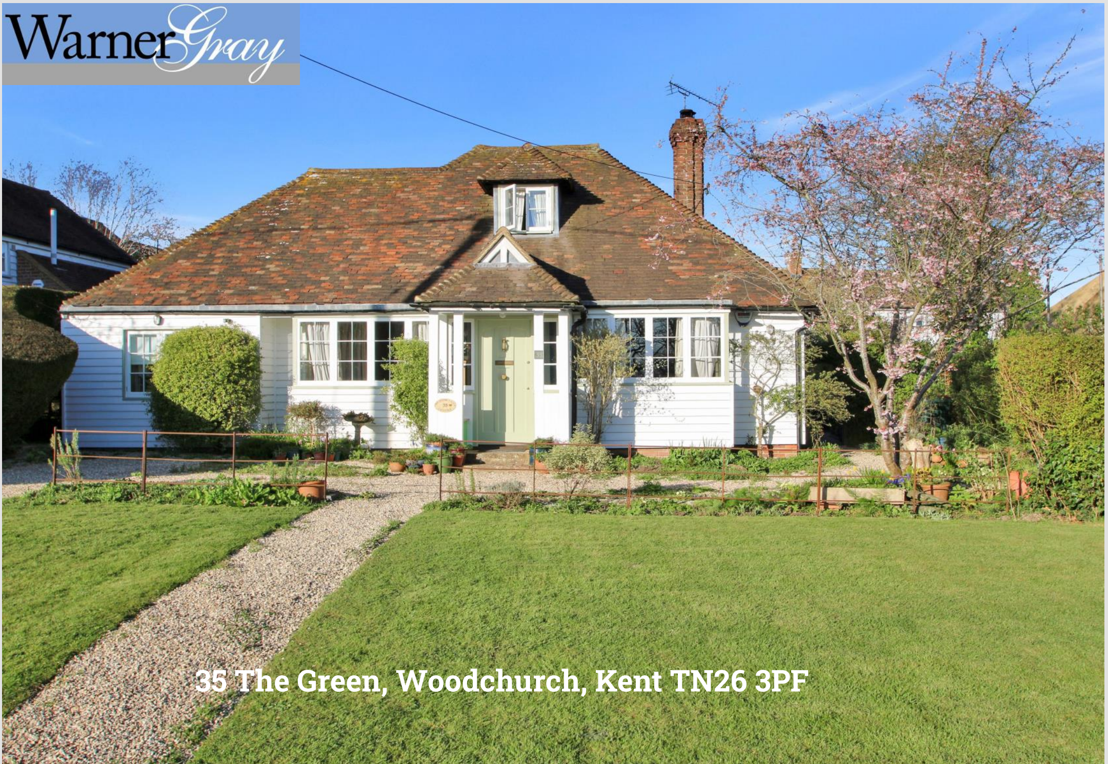
35 The Green, Woodchurch, Kent TN26 3PF