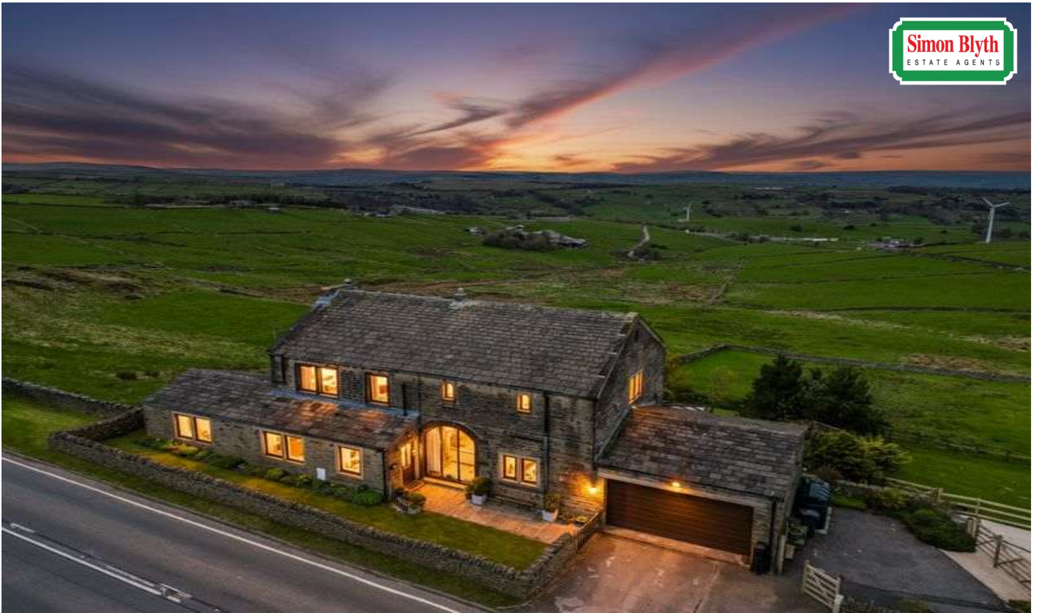
Shays Laithe, Scammonden, Huddersfield, HD3 3FW