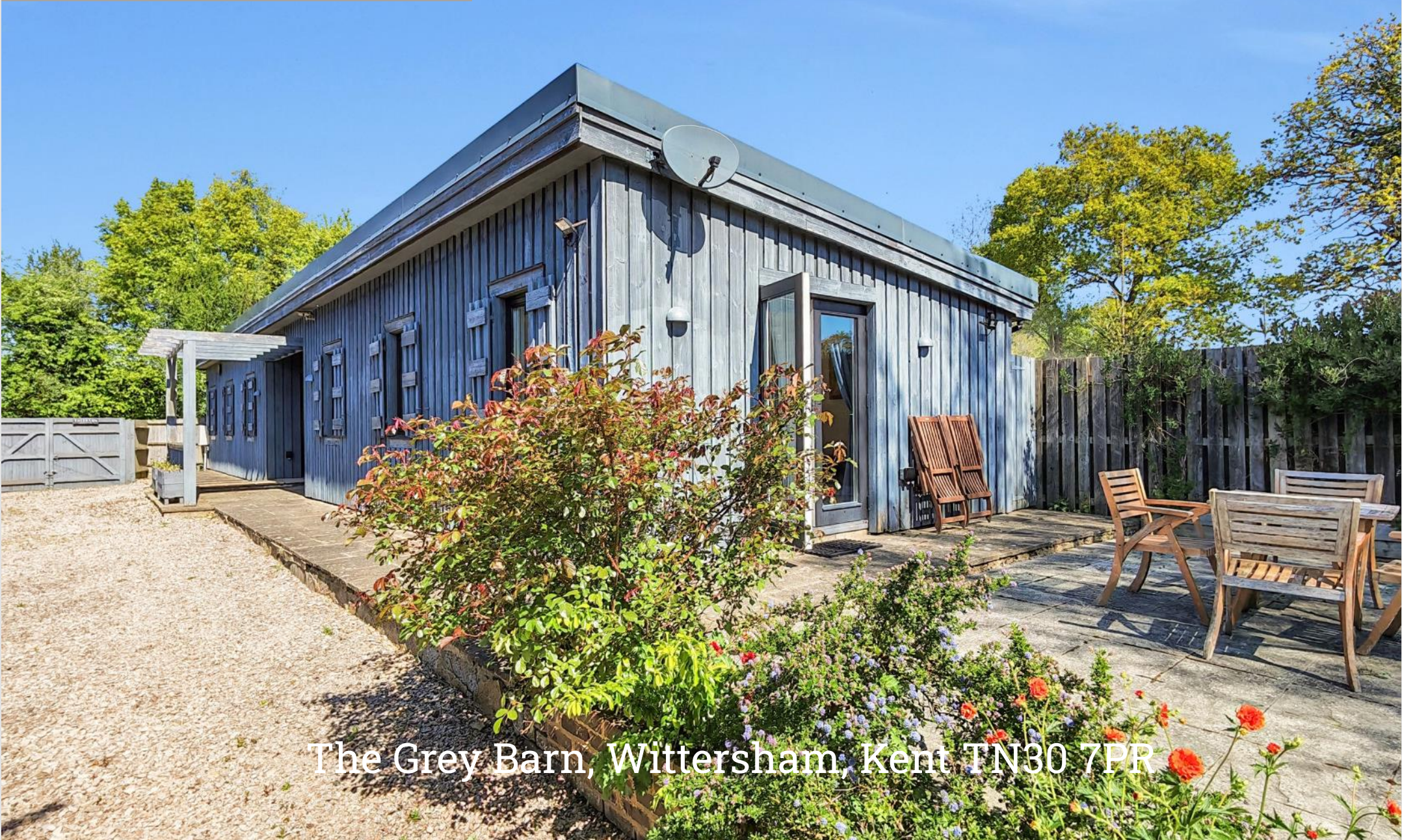
The Grey Barn, Wittersham, Kent TN30 7PR