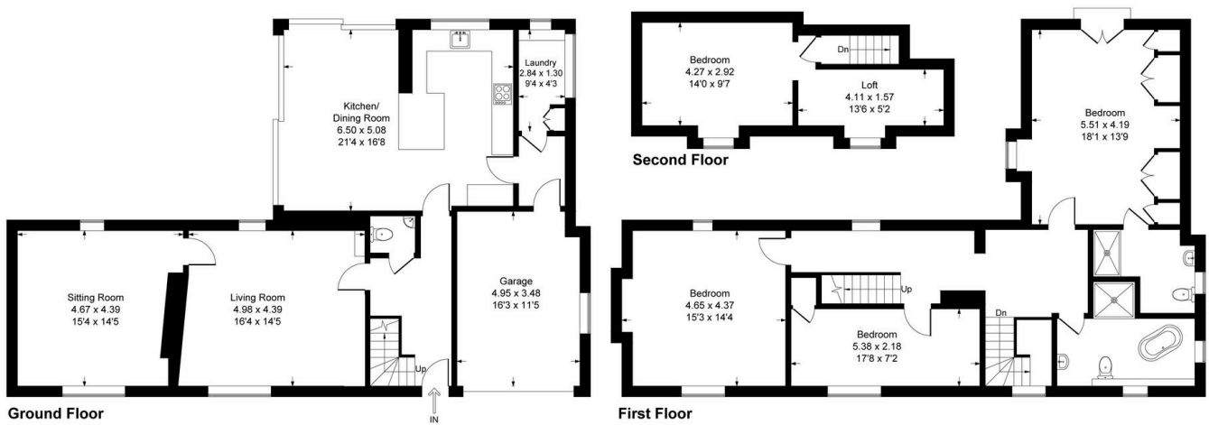
Illustration for identification purpose only, measurements approximate, and not to scale.

Approximate Gross Internal Area = 233.46 sq m / 2513 sq ft Approximate Gross External Area = 274.15 sq m / 2951 sq ft (Including Garage)