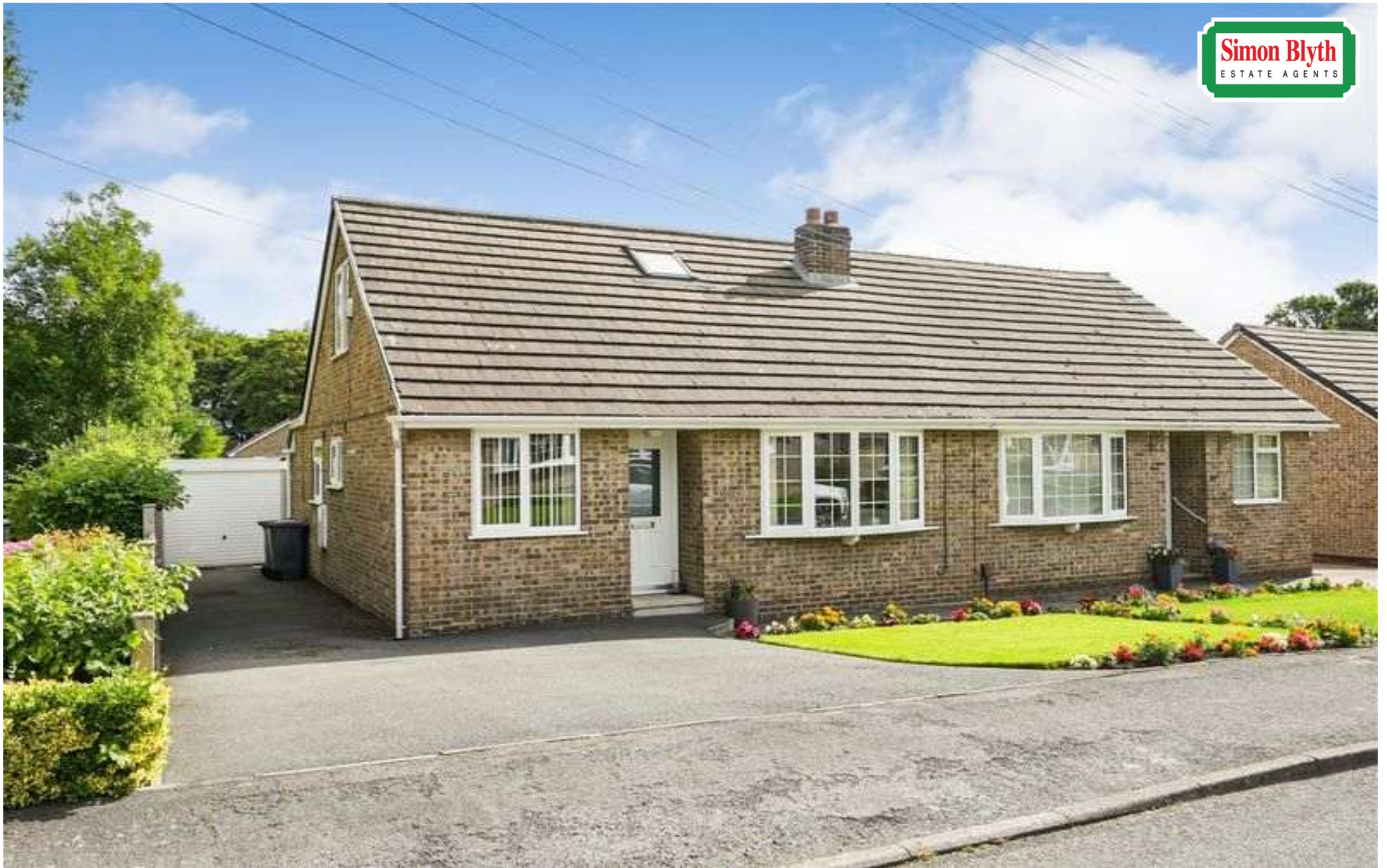
8 Sandmoor Drive, Lindley, Huddersfield, HD3 3WF