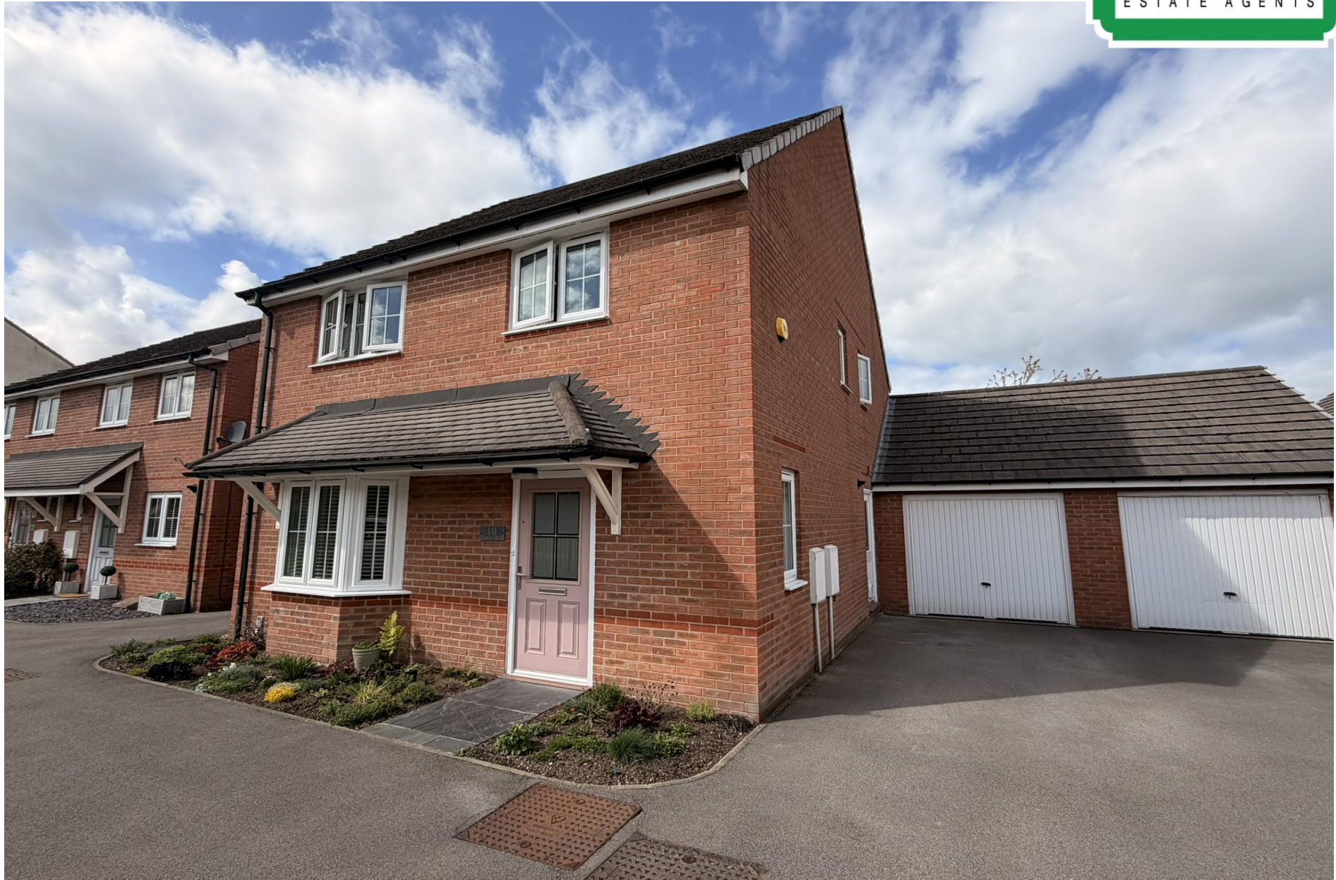
MOSSLEY PLACE, PENISTONE, S36 6FH