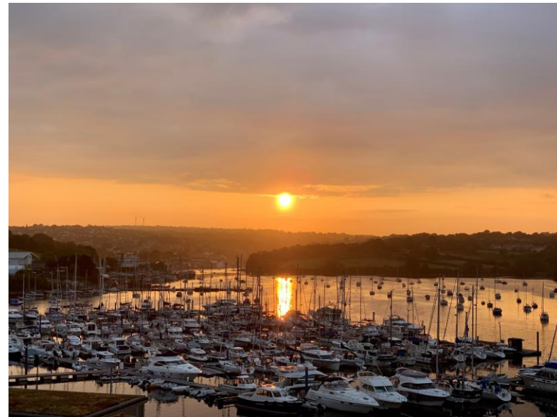
SUNSET FROM THE SLIPWAY