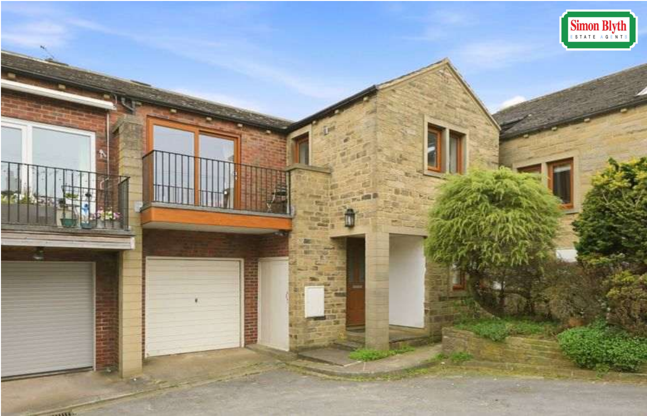
2 Aimbry Court, Kaye Lane, Almondbury, HD5 8XP