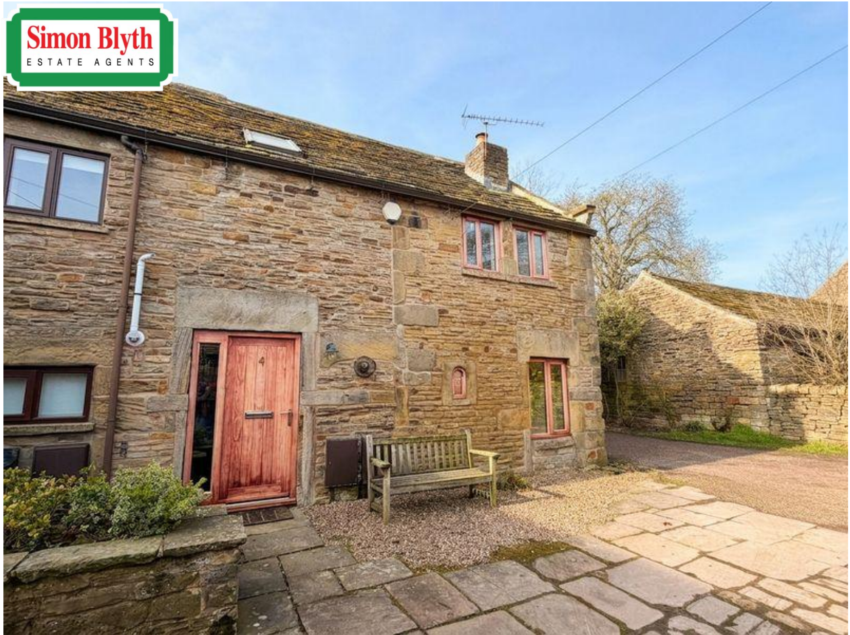
Woolley Manor Barn, Blacker Green Lane, Silkstone, S75 4NF