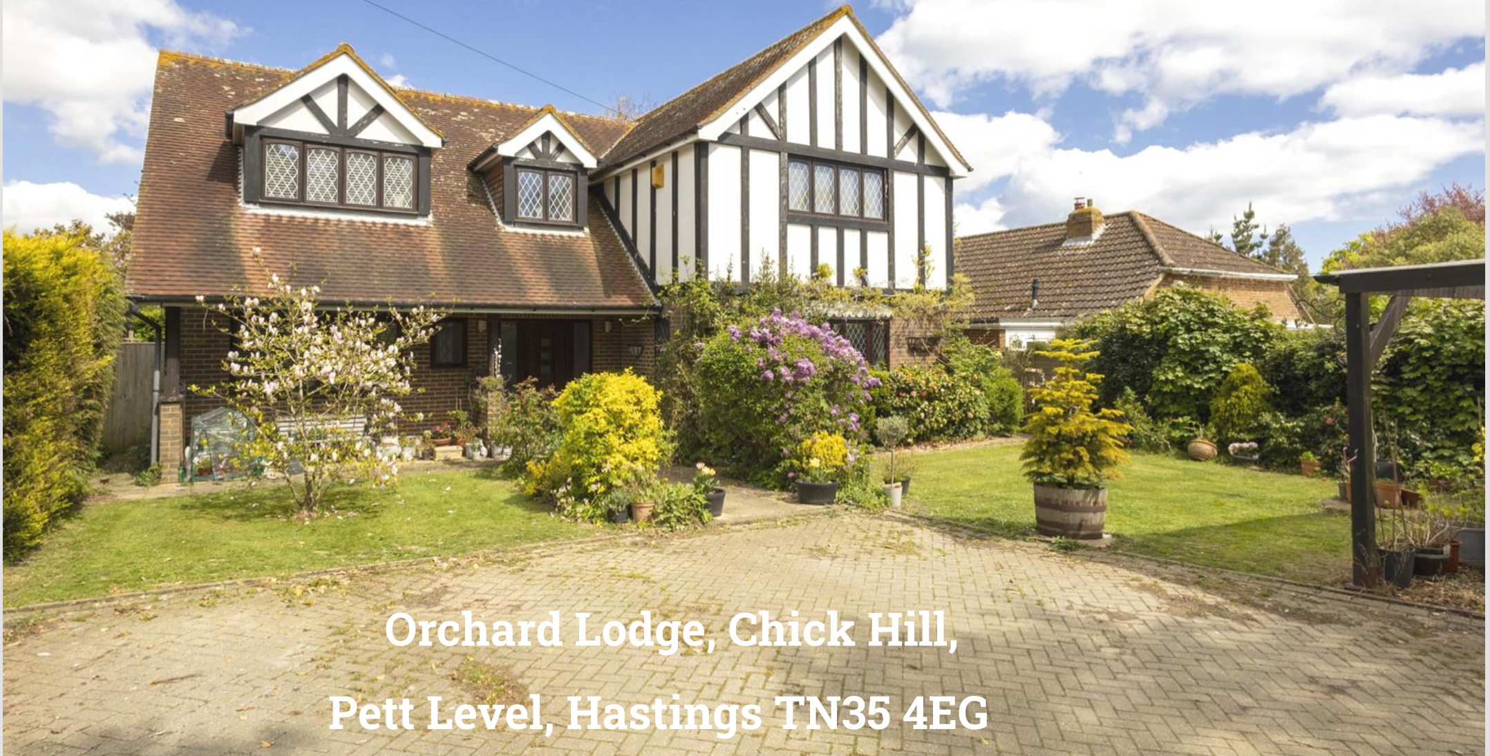
Orchard Lodge, Chick Hill, Pett Level, Hastings TN35 4EG