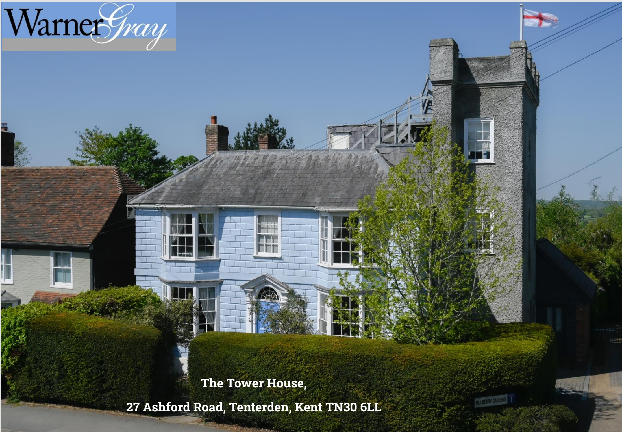
The Tower House, 27 Ashford Road, Tenterden, Kent TN30 6LL