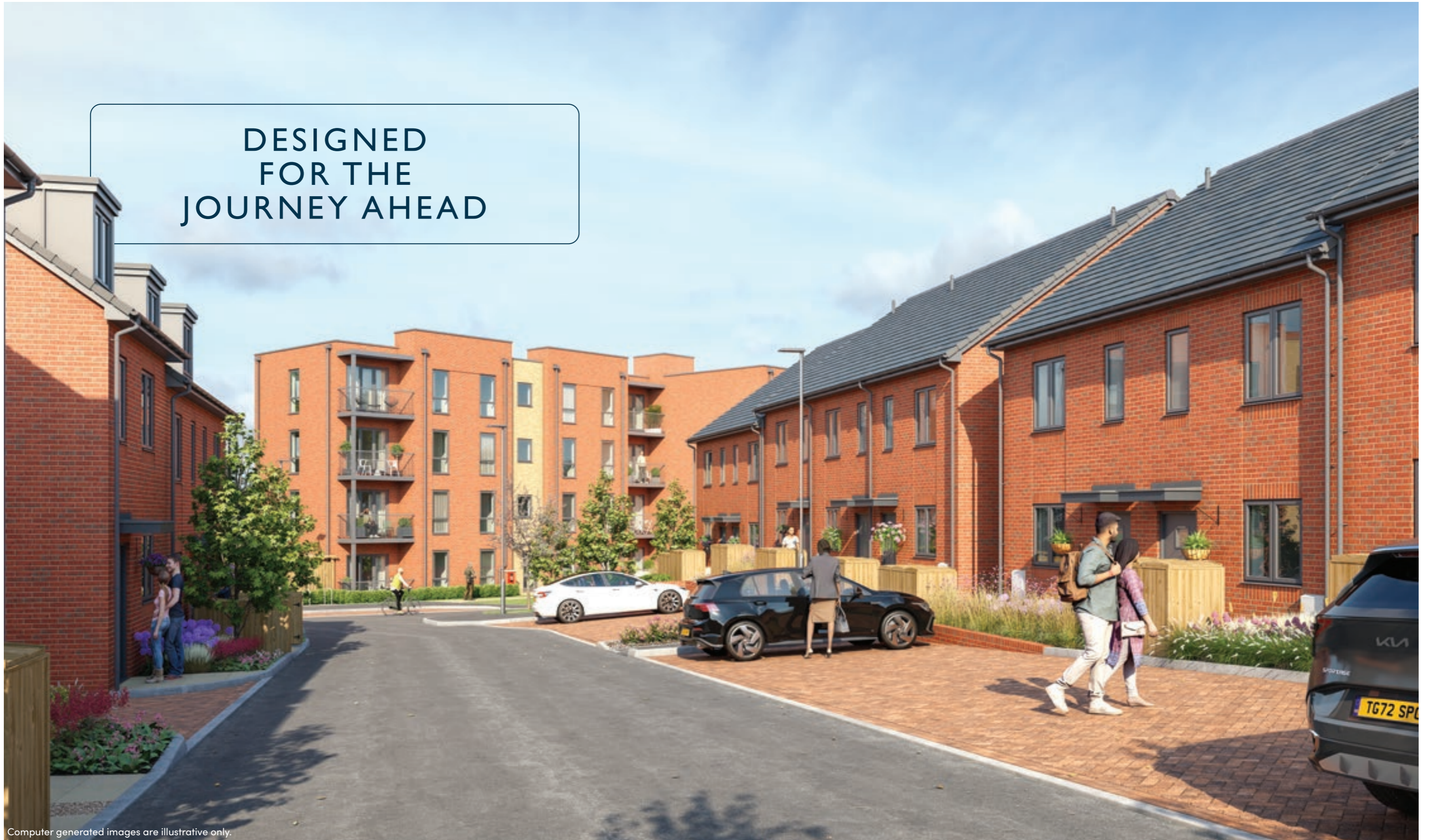
Computer generated images are illustrative only.