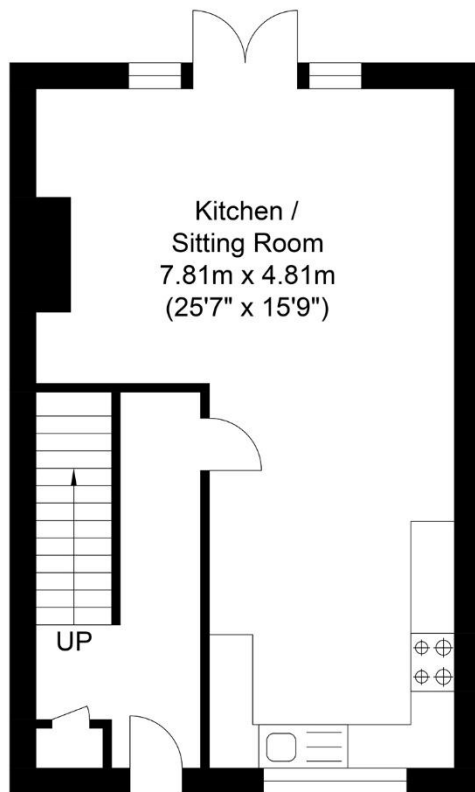
Ground Floor Approximate Floor Area 404.40 sq ft (37.57 sq m)