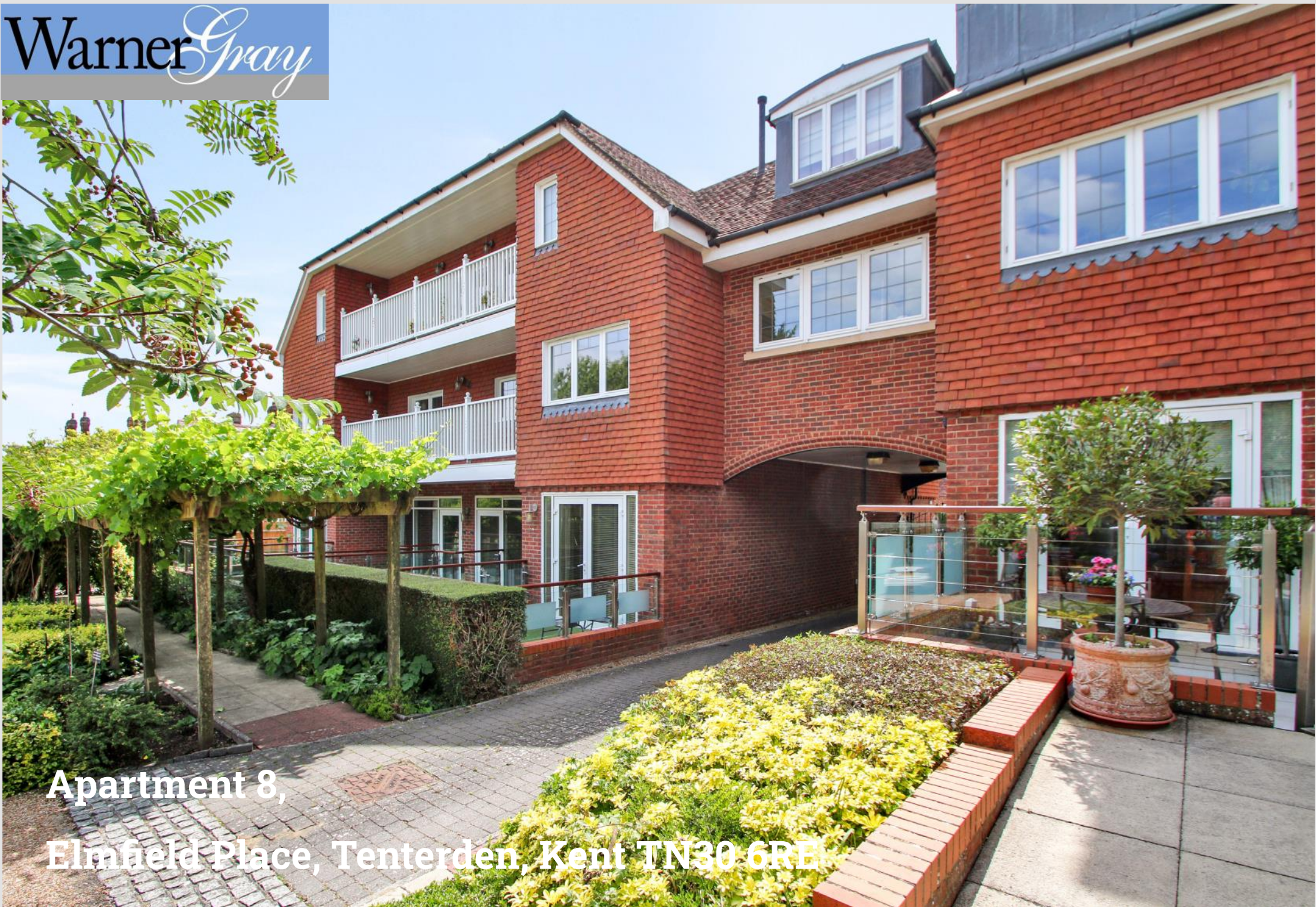
Apartment 8, Elmfield Place, Tenterden, Kent TN30 6RE