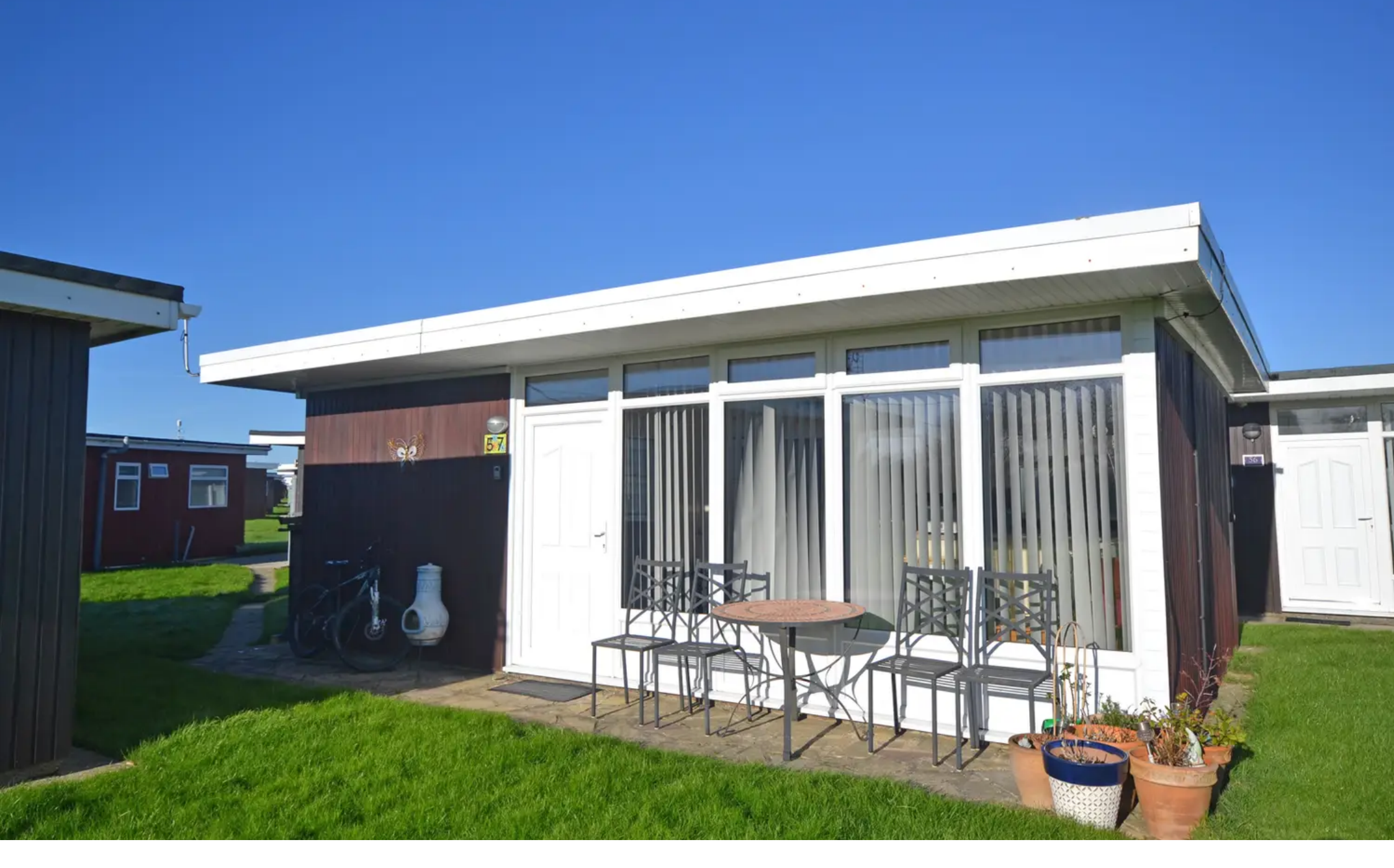
57 Granada, Selsey Country Club Guide Price £37,000 Licence