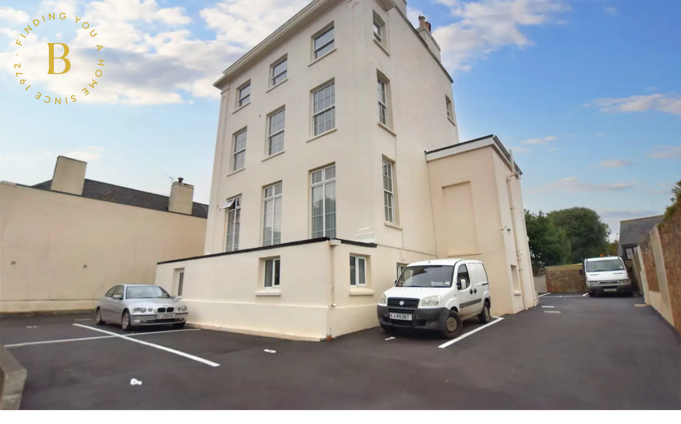
Flat 3, Ashley House, St. Saviours Hill, St. Saviour, Jersey £390,000