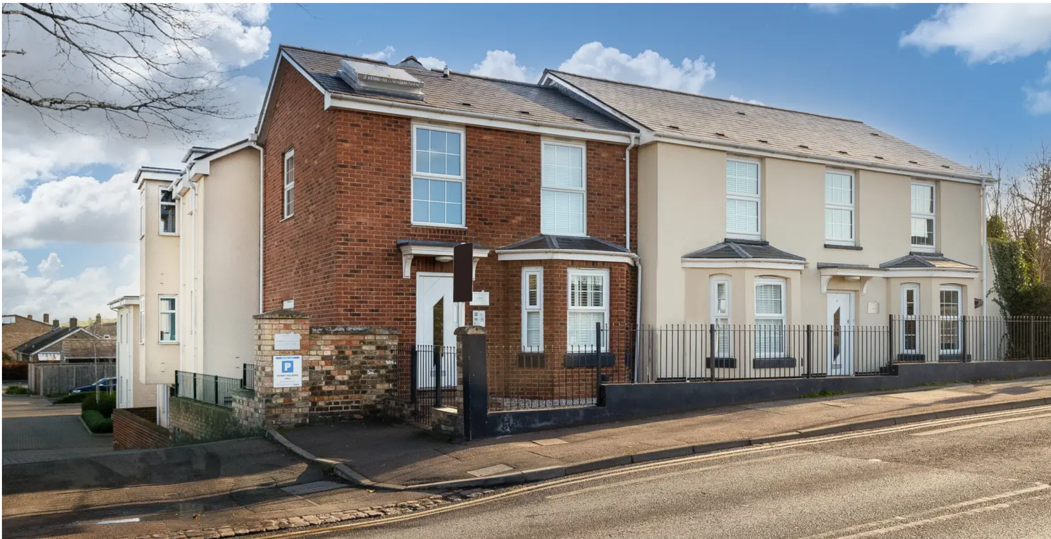
8 North Star Court Old North Road, Royston Royston