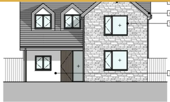
Dwelling No. 1 - Proposed North Elevation Scale 1:100 @ A3

The site area is 1863m2 (0.186 Ha). There is an opportunity to purchase a similar scheme, Plot 2 located beside Gwel Helyk or the titles can be split.