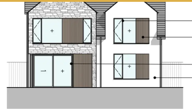
Dwelling No. 1 - Proposed South Elevation Scale 1:100 @ A3