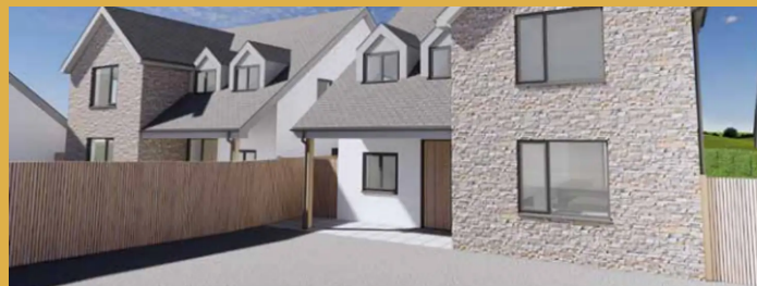
3D Visualisation - Front Elevation