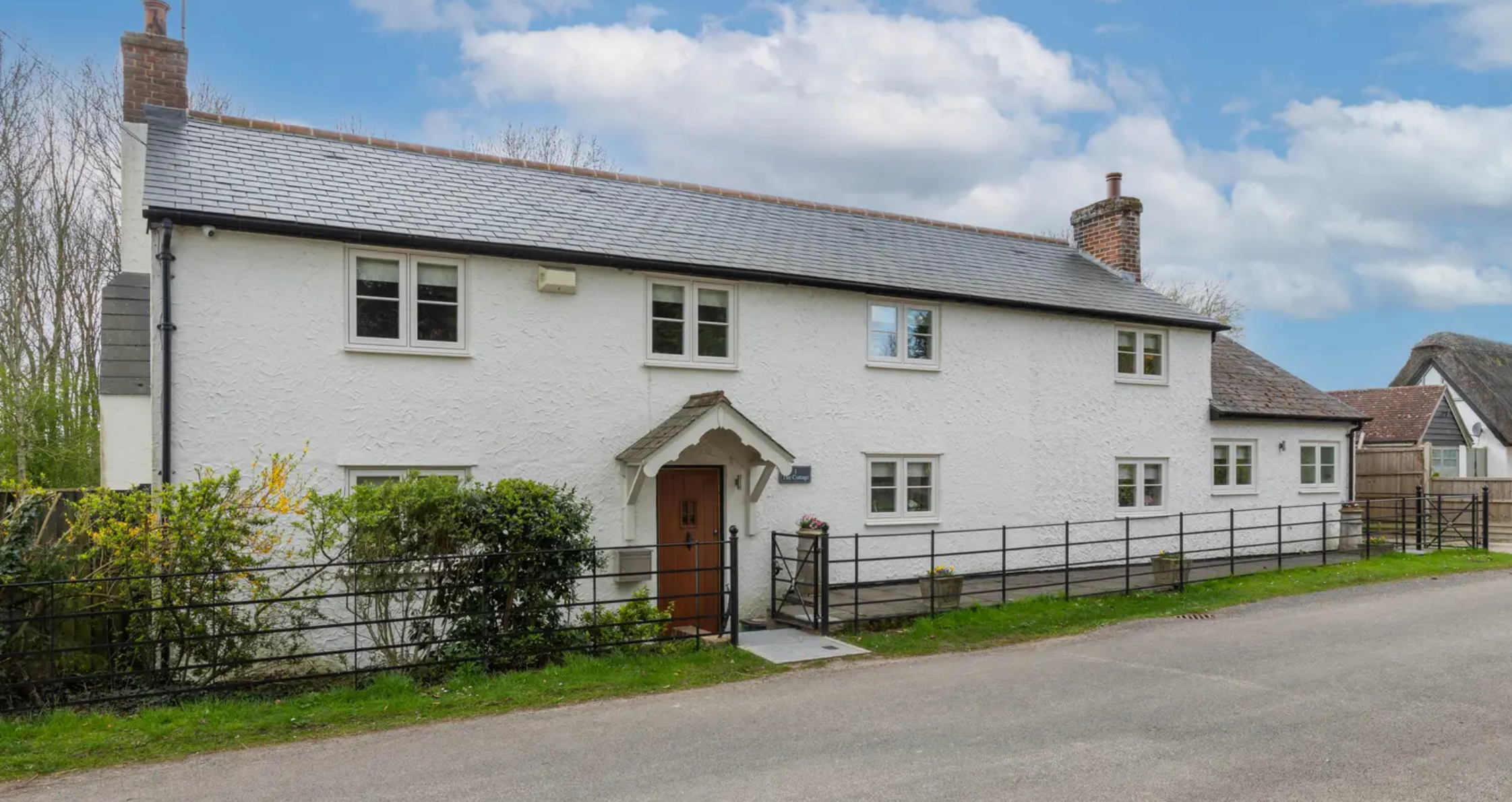
1 The Cottage, Little Hormead Buntingford