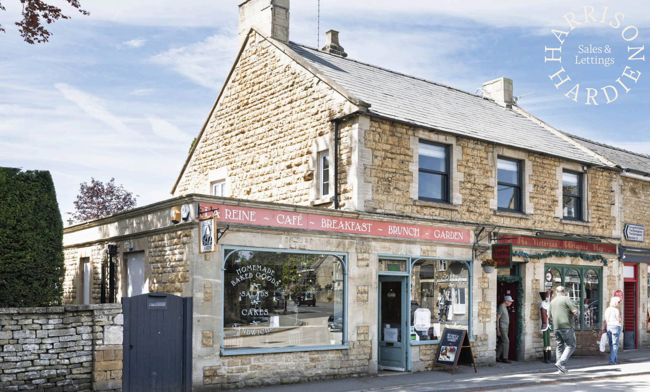
Rissington Road, Bourton on the Water