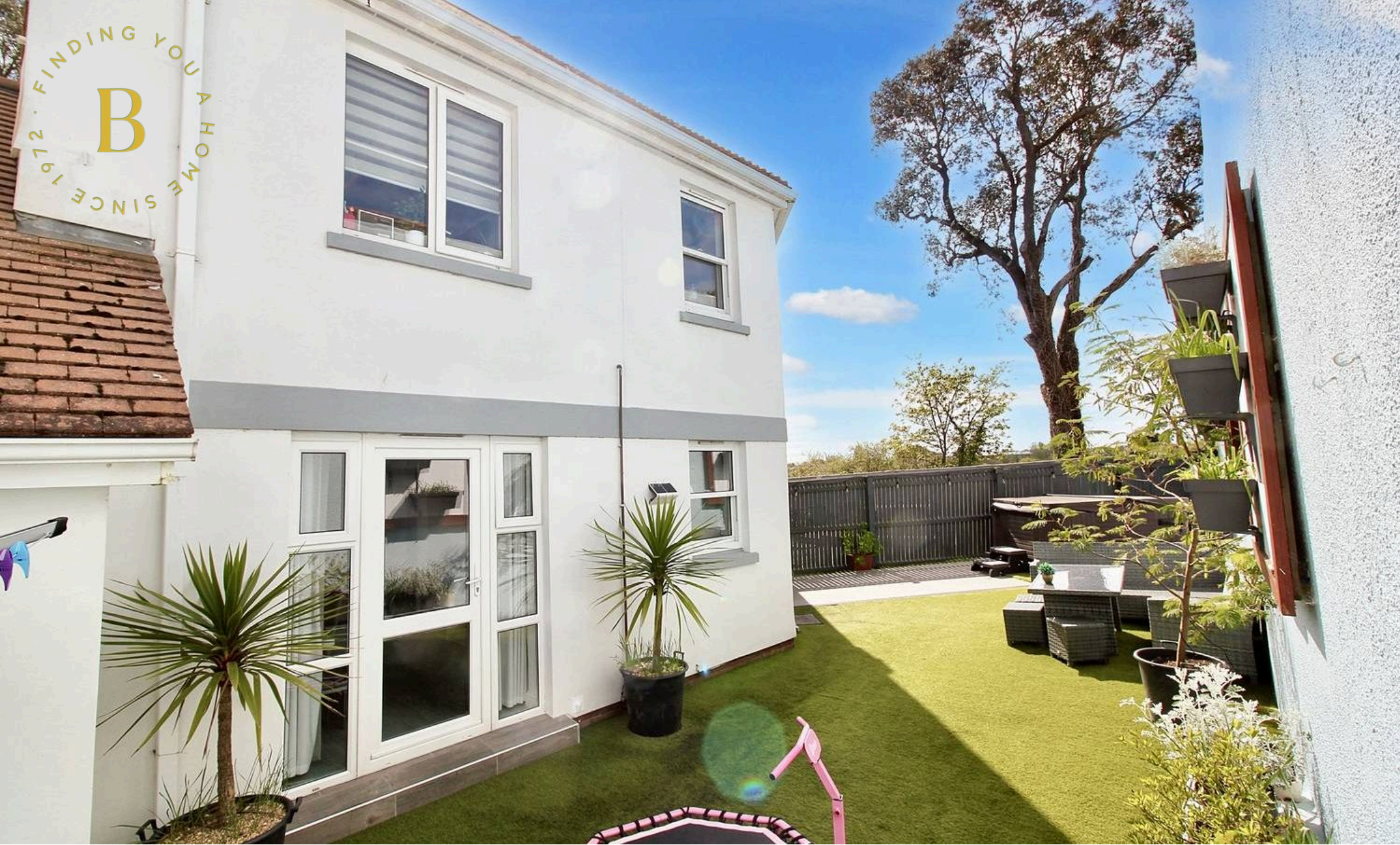
2 Ash Court, La Route De La Trinite, St. Helier £670,000

BROADLANDS FINDING YOU A HOME SINCE 1972