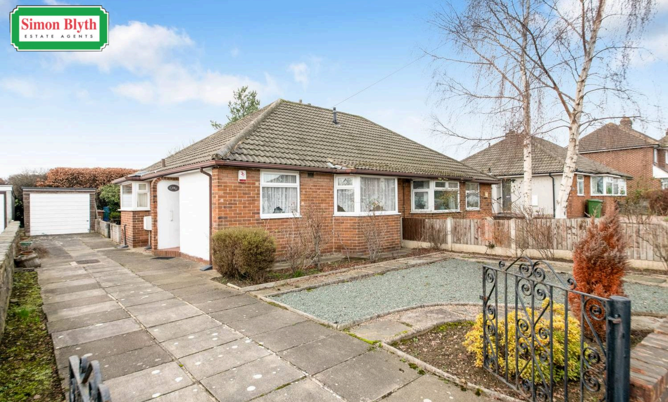
The Crescent, Altofts Wakefield