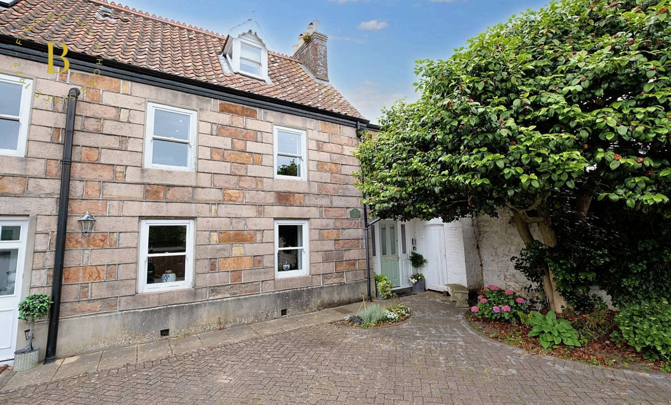
2 Villa Franca, La Route De Beaumont, St. Peter £835,000

BROADLANDS FINDING YOU A HOME SINCE 1972