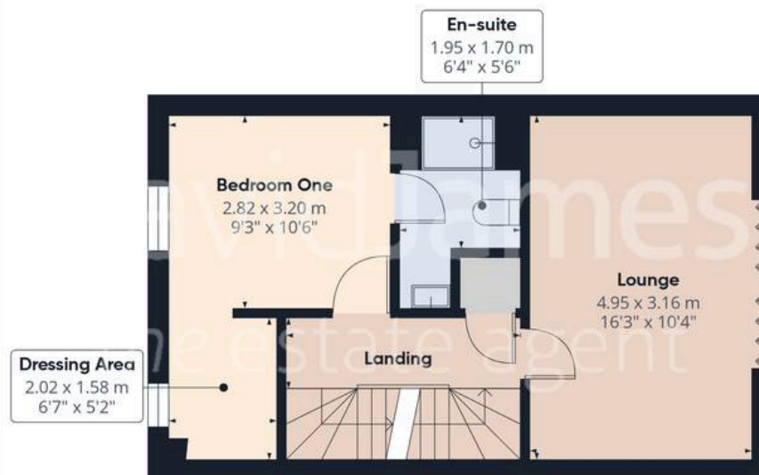
Floor 1 Building 1