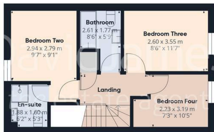
Floor 2 Building 1