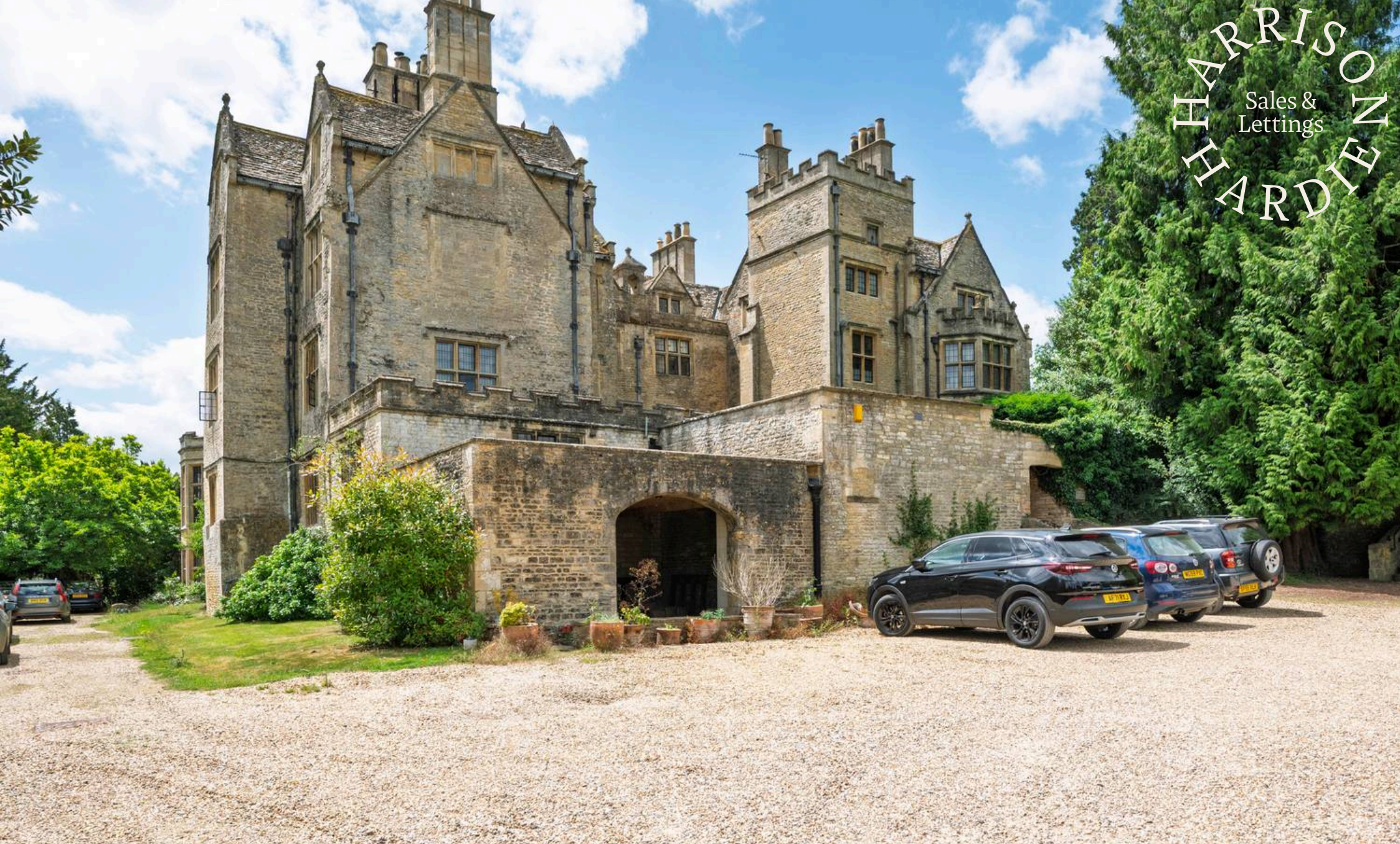
Shipton Court, Shipton-Under-Wychwood