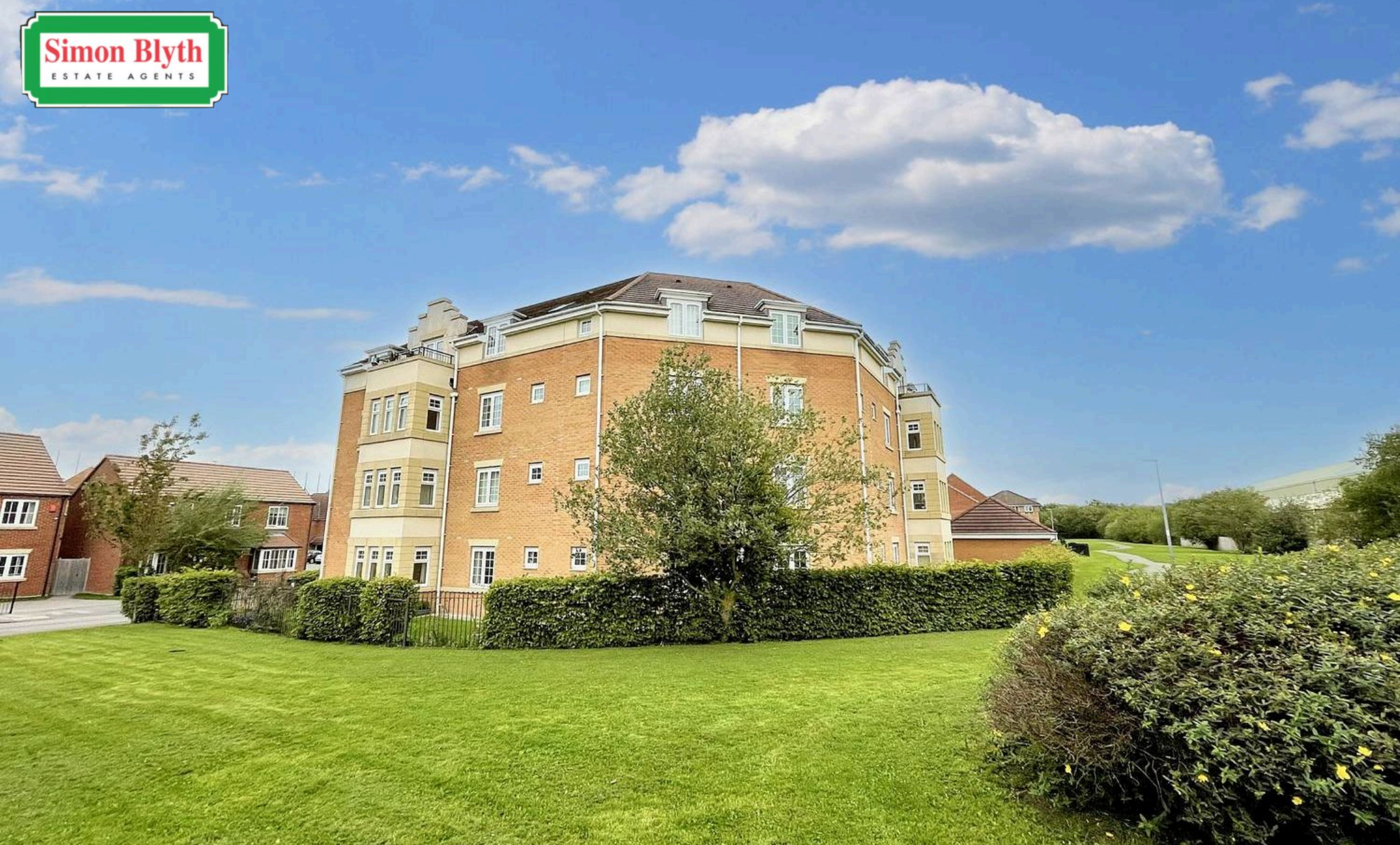
Elmroyd Court, Penistone