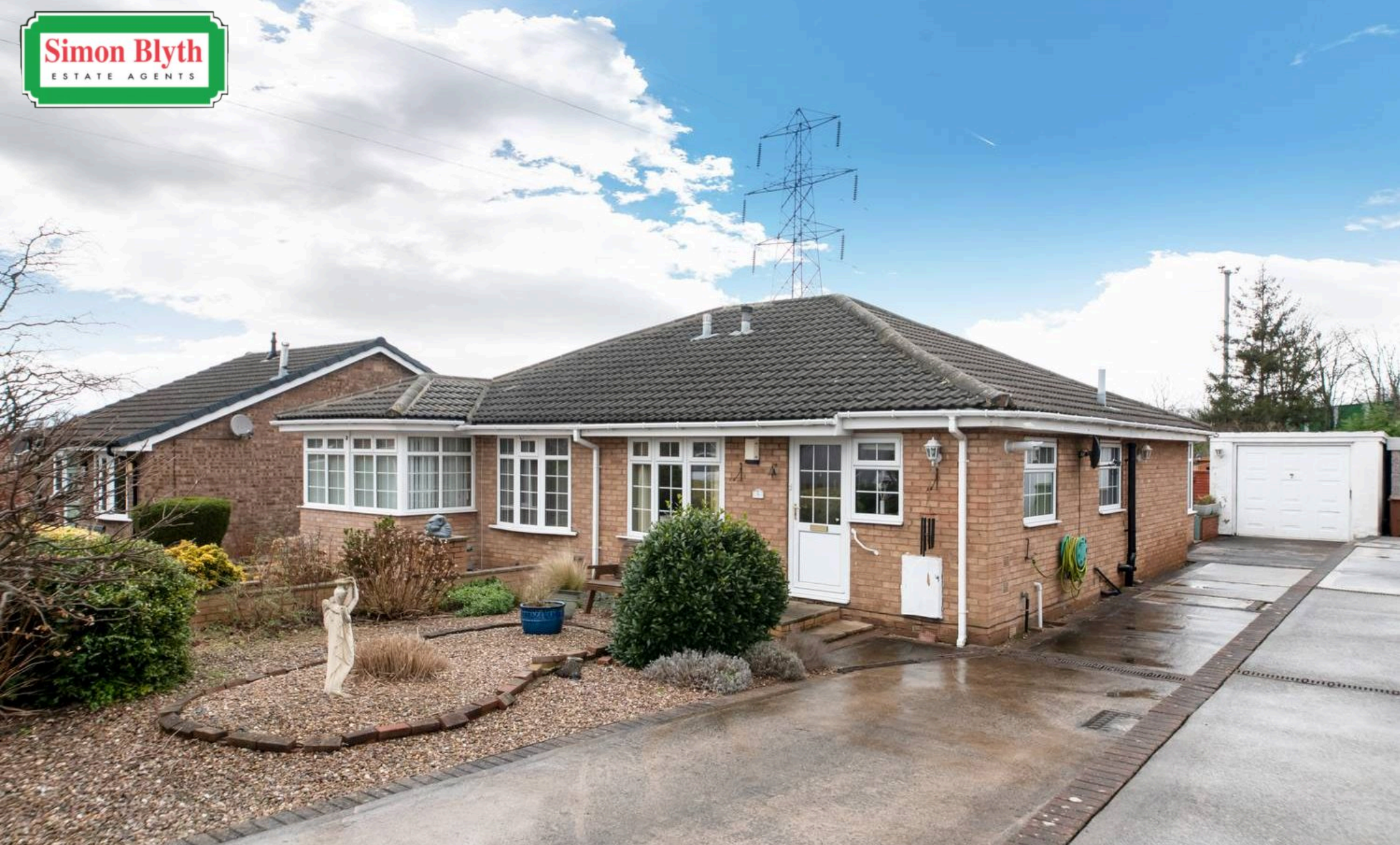
Kirkdale Drive, Calder Grove Wakefield