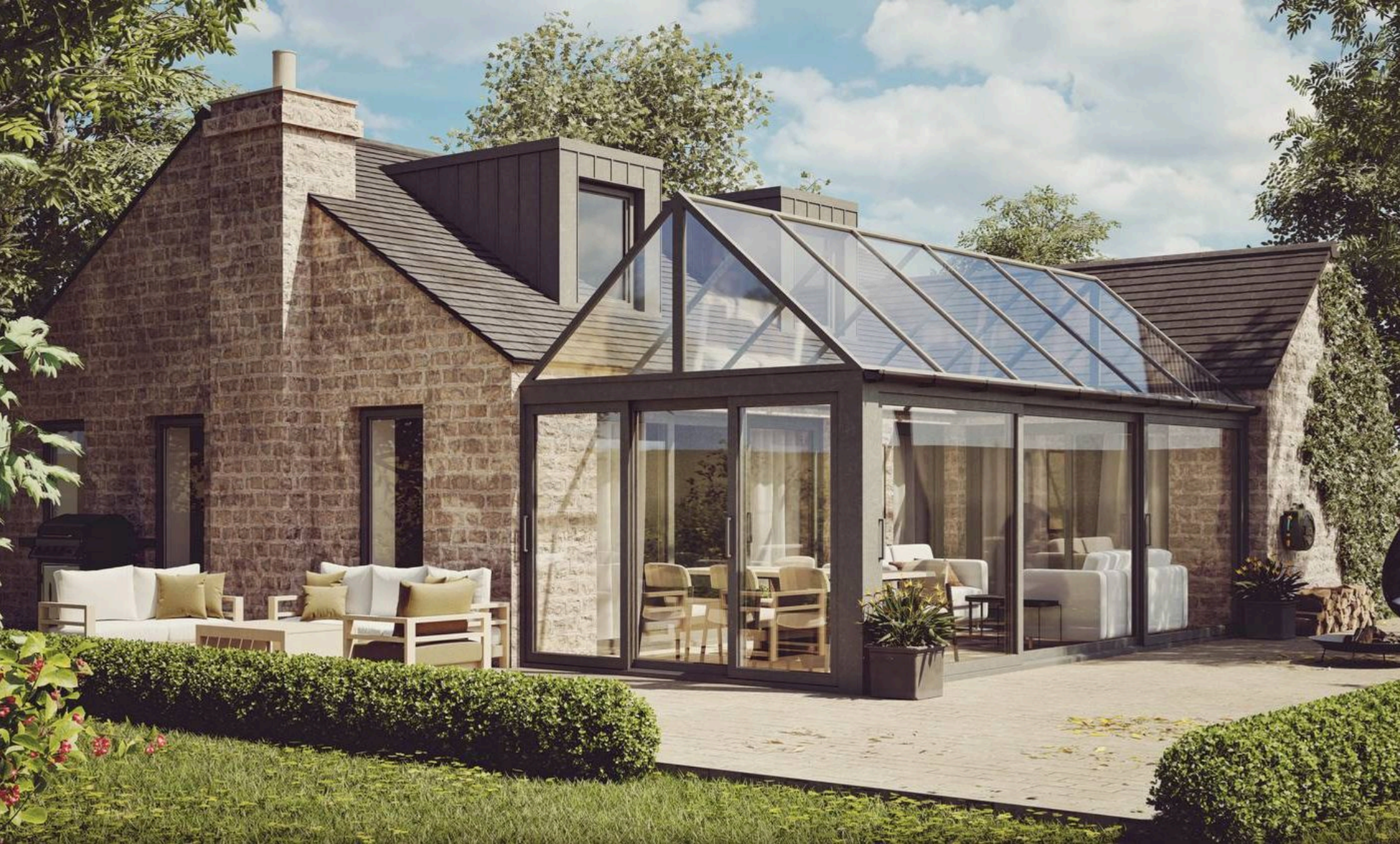
CGI architect's impression