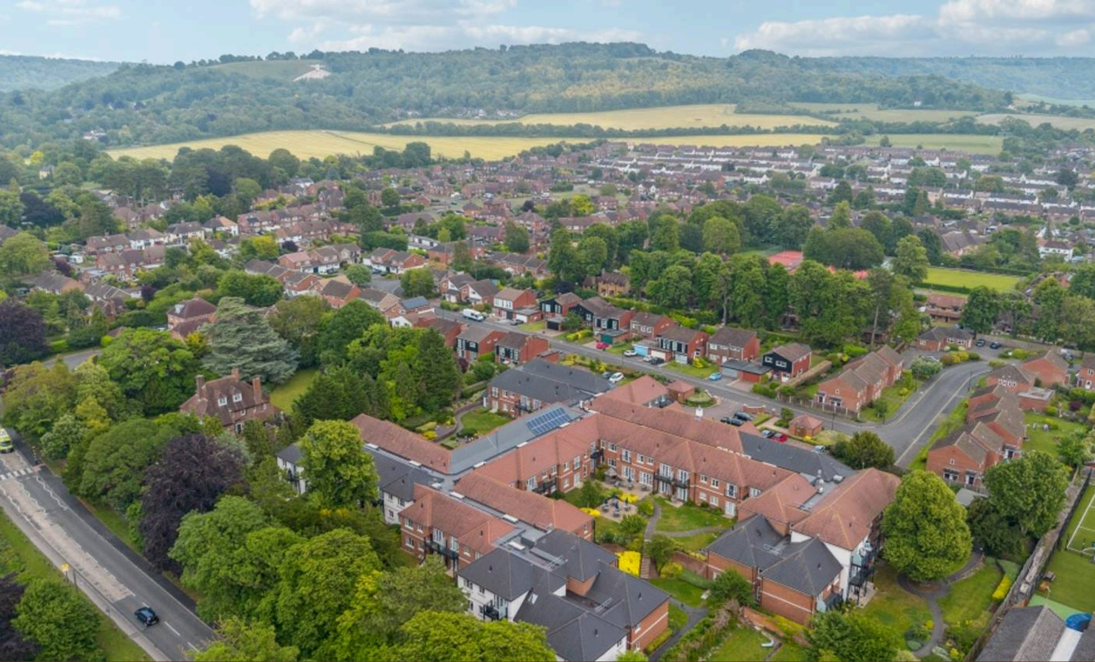
6 Eaves Court The Retreat, Princes Risborough - HP27 0EQ £200,000