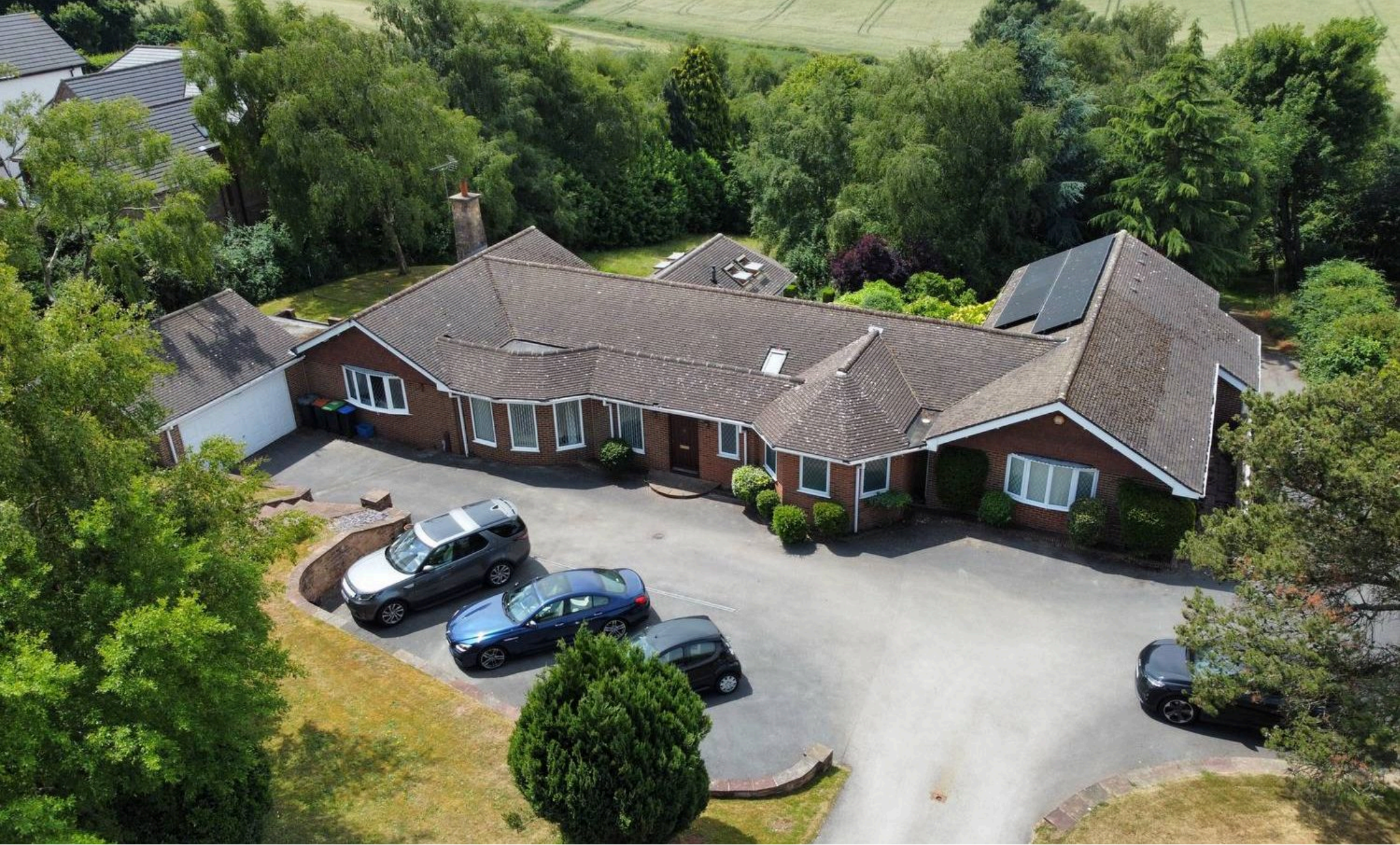
White Eaves, Coxmoor Road, Sutton in Ashfield, NG17 5LF £770,000