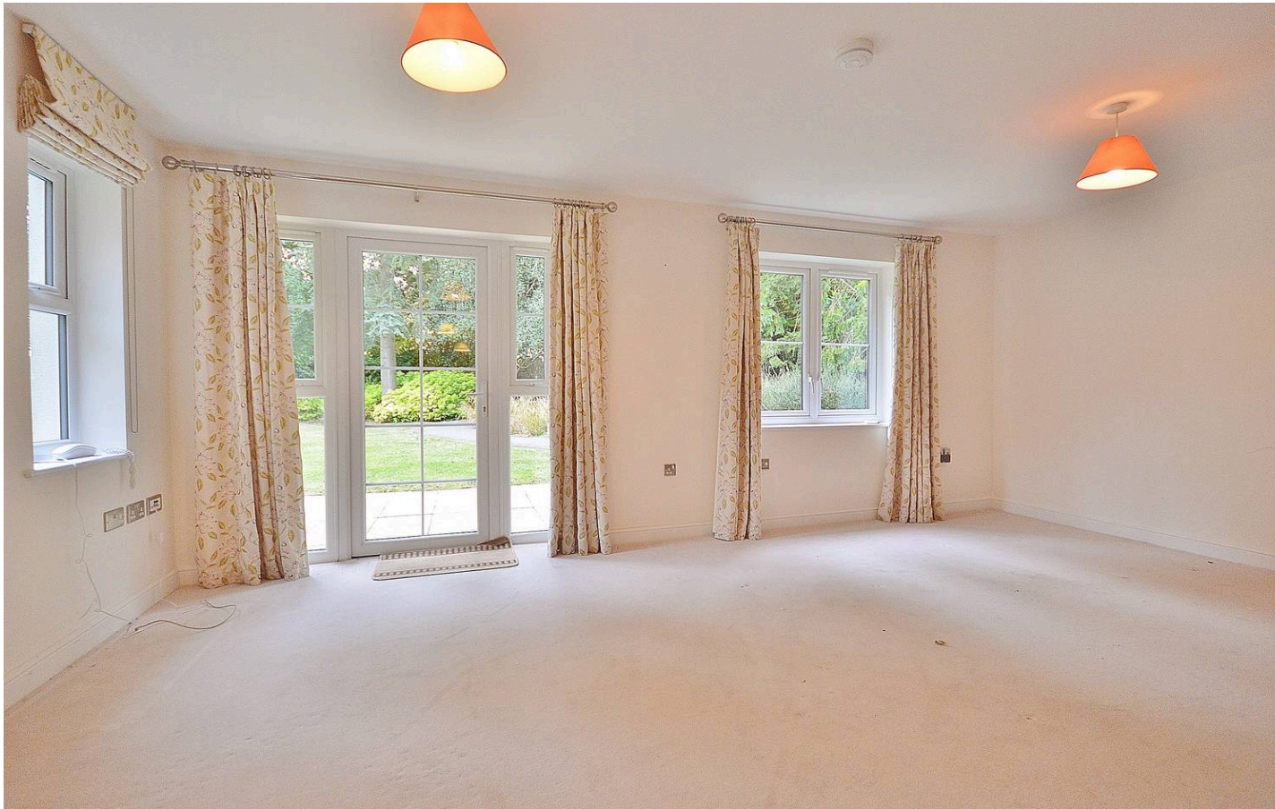
27 Eaves Court, The Retreat Princes Risborough