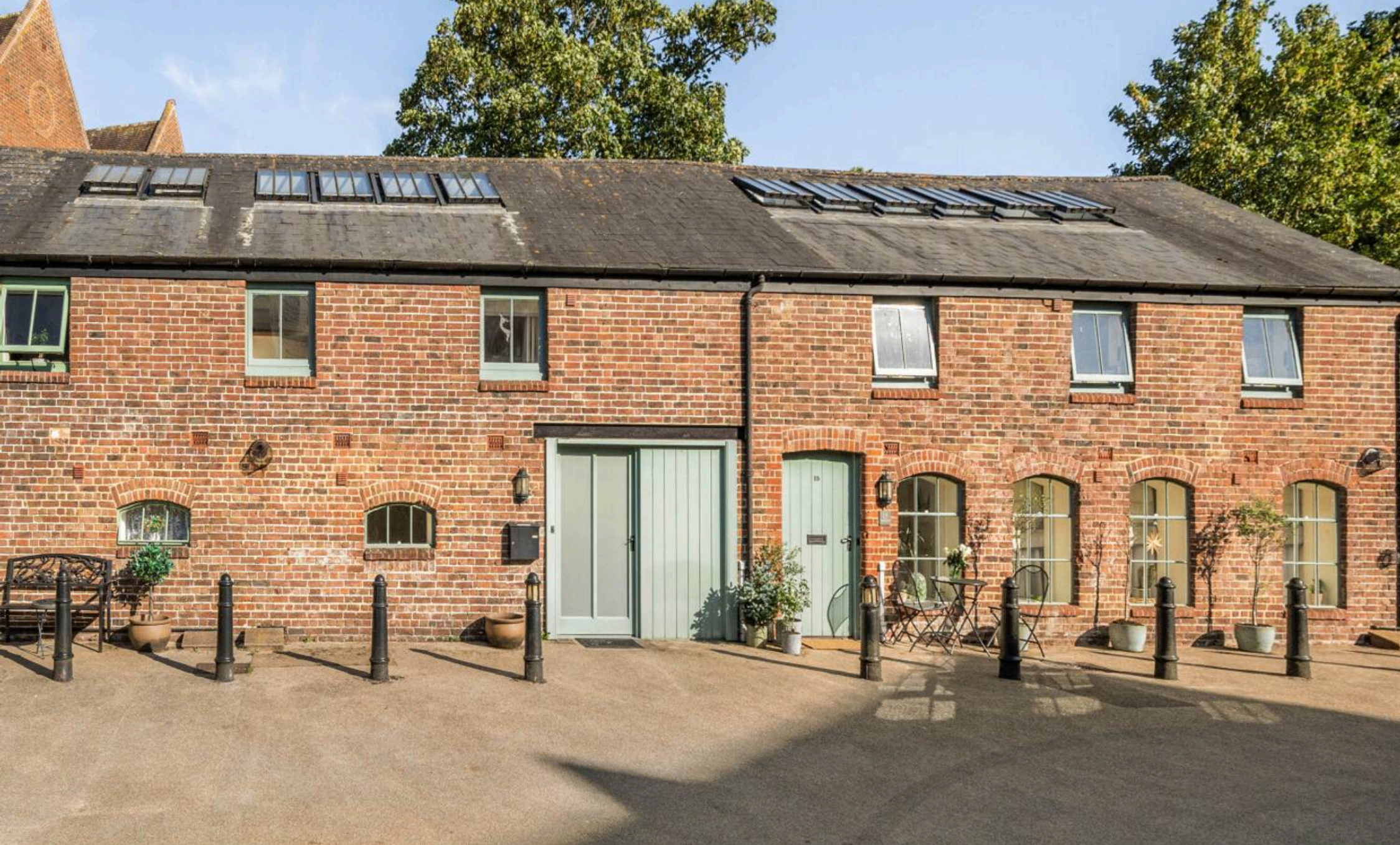
11 Springwell, Havant In Excess of £350,000 Freehold