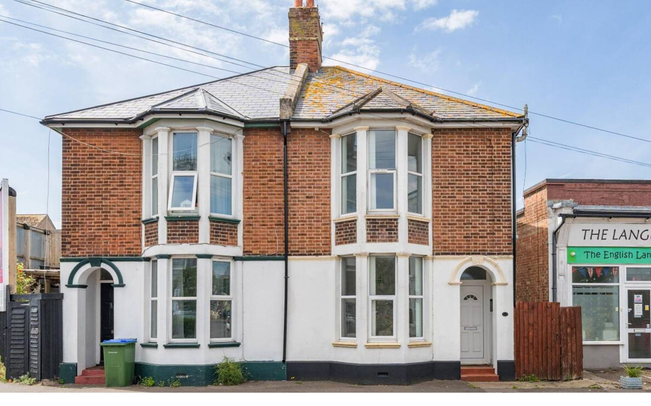
3 Canada Grove, Bognor Regis Guide Price £270,000