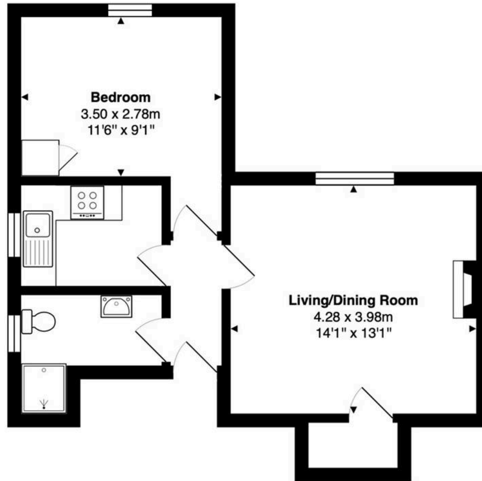
First Floor Area: 40.9 m 2 ... 440 ft 2

FOR ILLUSTRATIVE PURPOSES ONLY. NOT TO SCALE