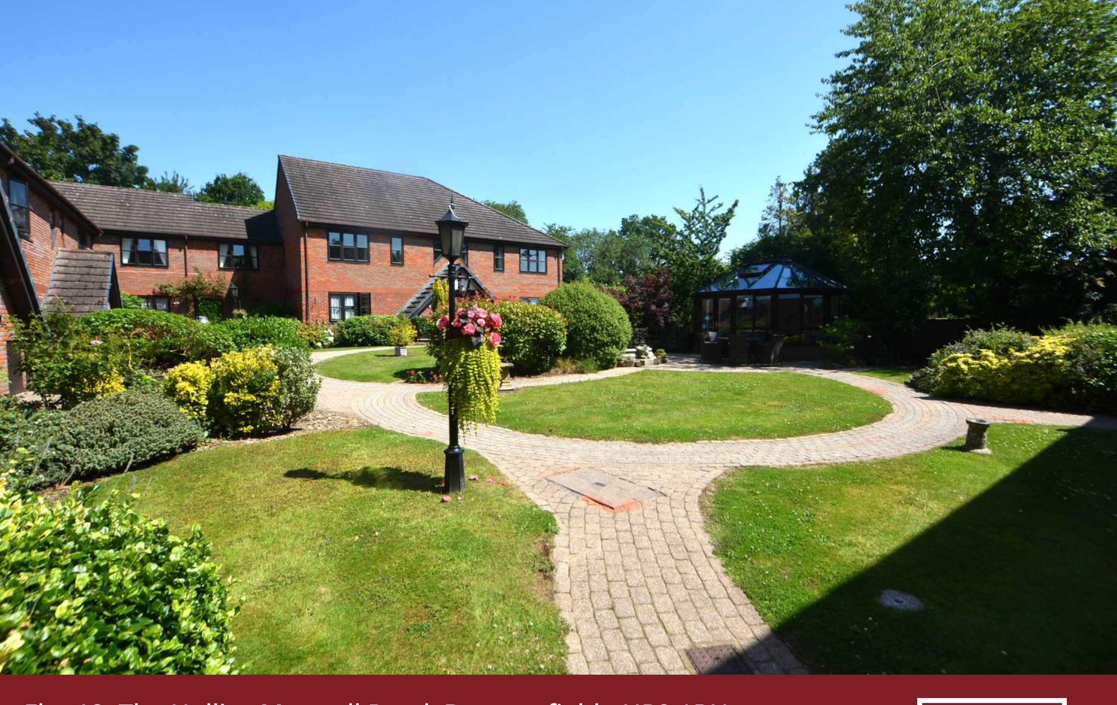
Flat 12, The Hollies Maxwell Road, Beaconsfield - HP9 1RH Guide Price £230,000