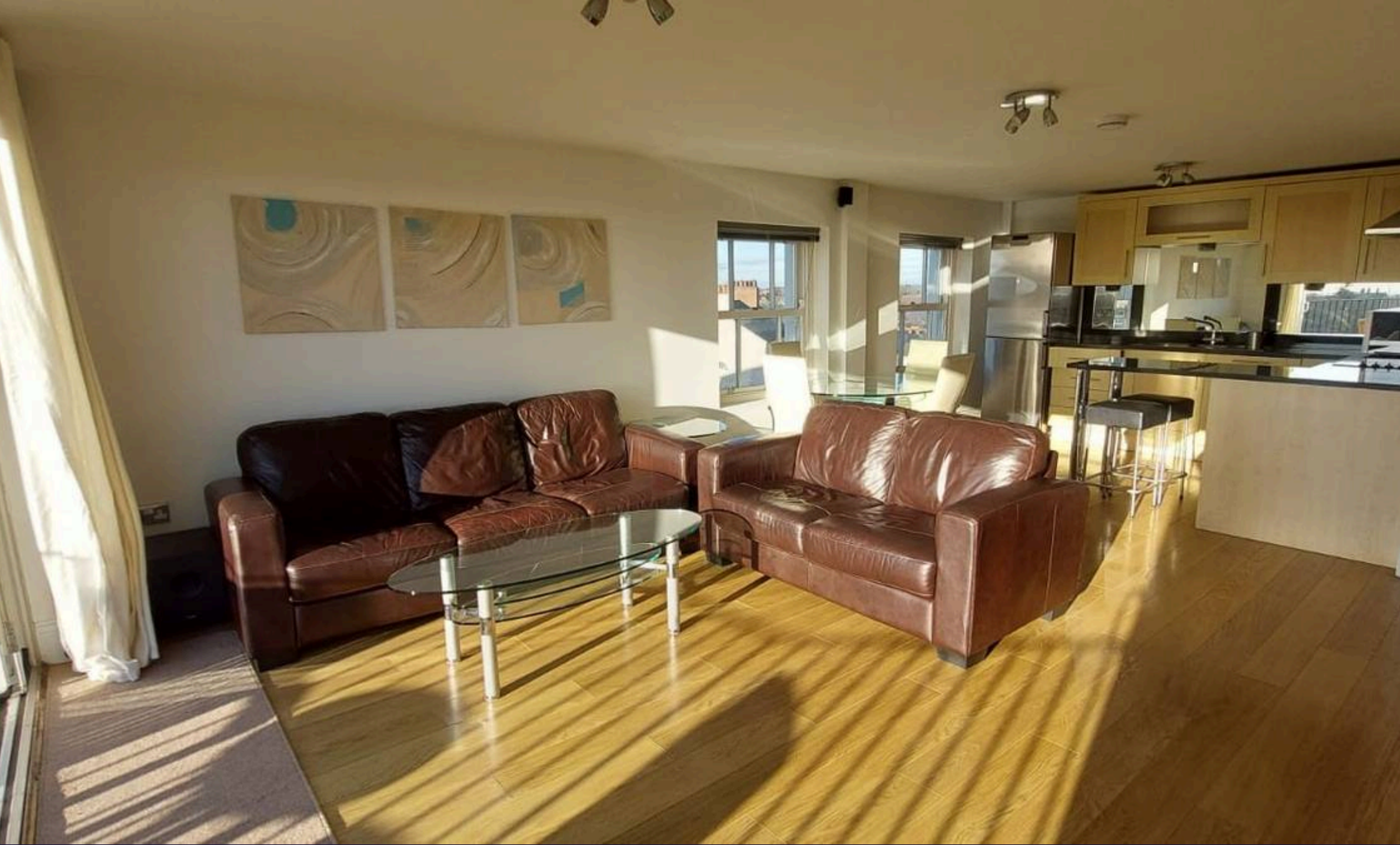
Park Heights, The Ropewalk, Nottingham £1,475 pcm